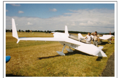
OO-103 Rutan Vari-Eze on 22 Julv 1993 Moulins