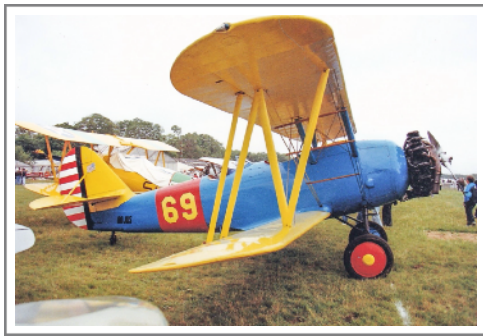
OO-JUS Naval Aircraft Factory N3N-3 on 6 June 1992 La Ferte Alais.jpg