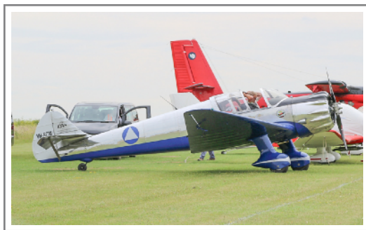
VH-SCW Ryan SCW on 07 July 2017 Duxford