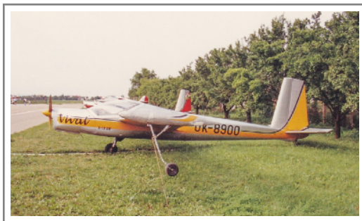
OK-8900 LET L.13SW Vivat on 18 June 1992 Kunovic