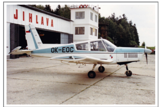
OK-EOC Zlin Z.43 on 19 June 1992 Jihlava