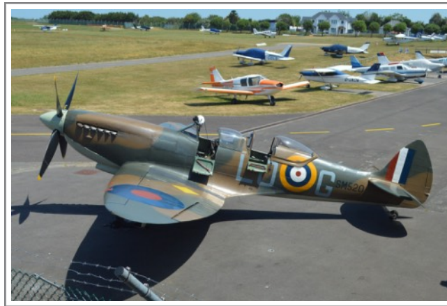
GILDA - 27 may 2026

Members and visitors at Jersey Aero Club were treated to a spectacular sight on Wednesday 27th and Thursday 28th May as the team from Spitfires.com visited Jersey with their beautifully restored two-seat Supermarine Spitfire, SM520 (registration G-ILDA), based at Goodwood Aerodrome.