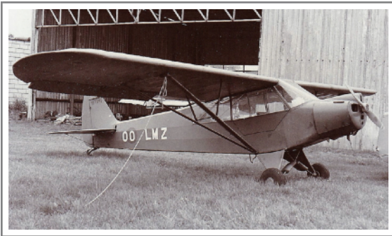
OO-LMZ Piper PA.18-95 Super Cub on 28 September 1973 Hasselt-Kiewit