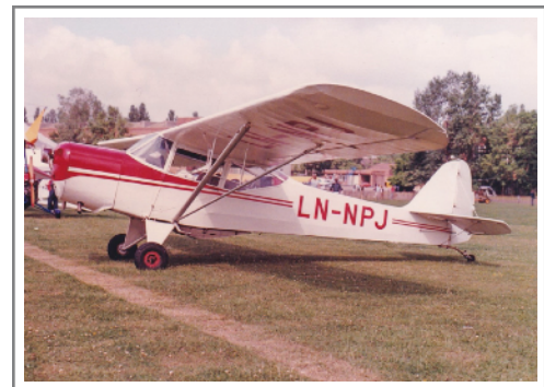
LN-NPJ Auster on 5 July 1986 Cranfield