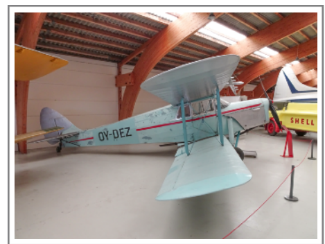
OY-DEZ DH.87B Hornet Moth on 11 August 2019 Stauning