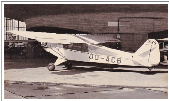
OO-ACB Piper J.3C-65 Cub on 29 September 1973 Grimbergen