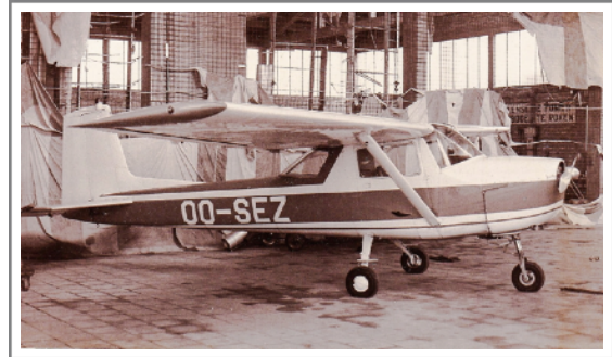
OO-SEZ Cessna 150 on 29 September 1973 Grimbergen