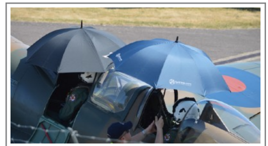
Midday sun- GILDA - 27 may 2026

The visit coincided with exceptionally warm weather across the Channel Islands, providing near-perfect flying conditions and some of the highest temperatures seen so far this year. Jersey recorded temperatures of 34.2°C during the visit, making it one of the warmest periods of the spring and well above the seasonal average for late May. The warm, settled conditions offered excellent visibility for flying and attracted many members and visitors to the airport to enjoy the spectacle. This said, extra steps were taken to keep passengers and crew cool with bottled water, and shade from umbrellas.