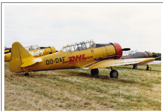
OO-DAF Noorduyn AT-16D Harvard IIB on 13 June 1987 Biggin Hill