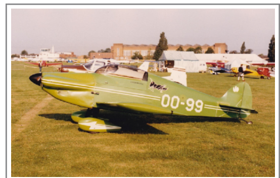
OO-99 Monnet Sonerai III on 3 July 1987 Cranfield.