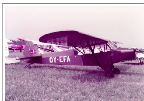
OY-EFA Piper PA.18-95 Super Cub on 5 June 1982 Stauning.jpg