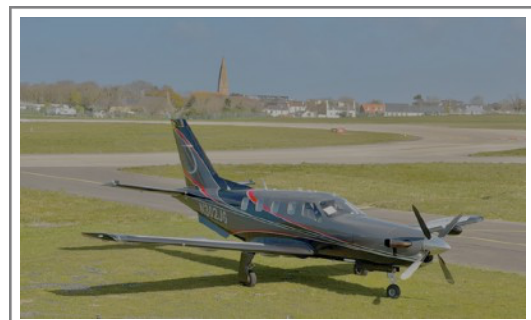
Recent Malibu visitor

We have started to see an increase in GA visitor traffic and an interesting mix of visitor aircraft. The desk is getting ready to welcome our visitors for the summer season.