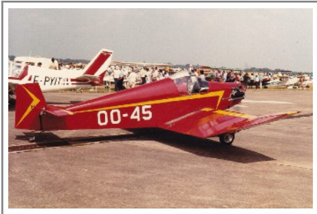
OO-45 Jodel D.92 Bebe on 30 July 1983 Brienne Le Chateau.jpg