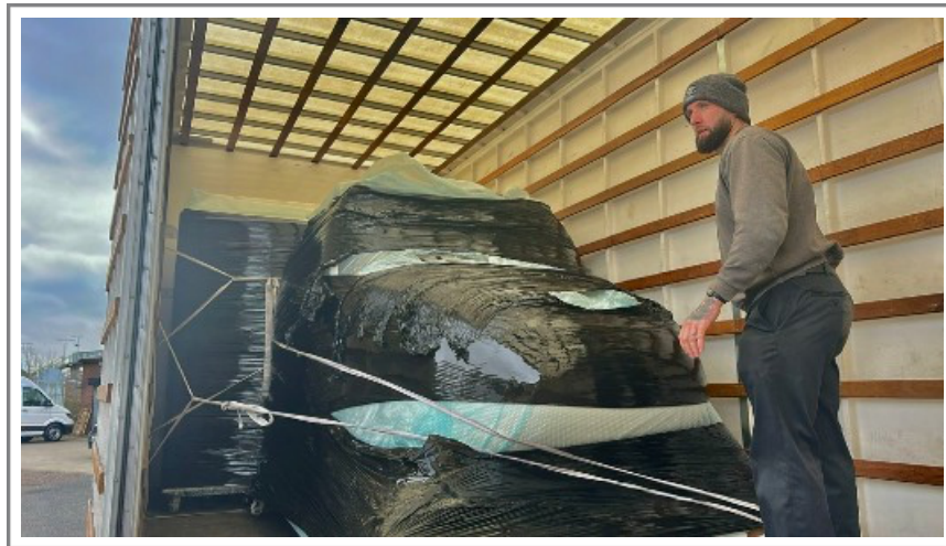
Simulator all wrapped up in Portsmouth awaiting ferry.

The old conference room on the ground floor is now prepared and ready for its new occupier.