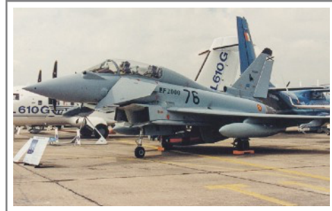
XCE.16-01 Eurofighter Typhoon on 16 June 1997 Le Bourget.jpg