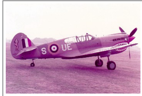
N1009N Curtiss P-40N West Malling.jpg