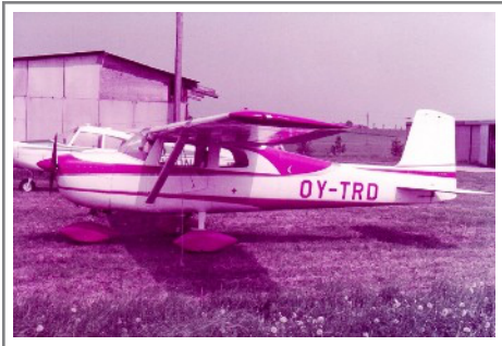
OY-TRD Cessna 150 on 6 June 1982 Aarhus.jpg