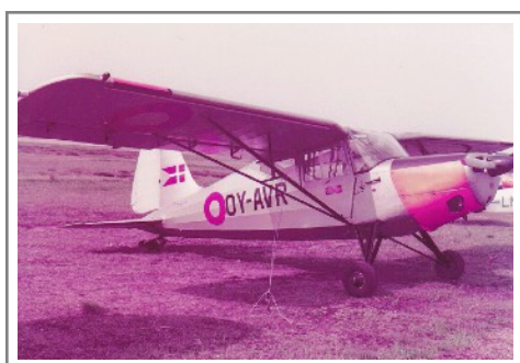
OY-AVR S.A.I. KZ 7 on 5 June 1982 Stauning.jpg