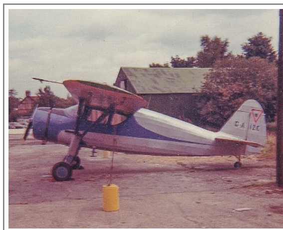
G-AIZE Fairchild F.24W-41 Argus on 8 September 1964 Elstree