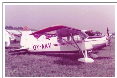
OY-AAV S.A.I.KZ 7 Lark on 5 June 1982 Stauning.jpg