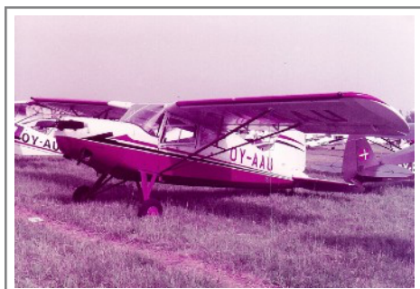
OY-AAU S.A.I.KZ 7 Lark on 5 June 1982 Stauning.jpg