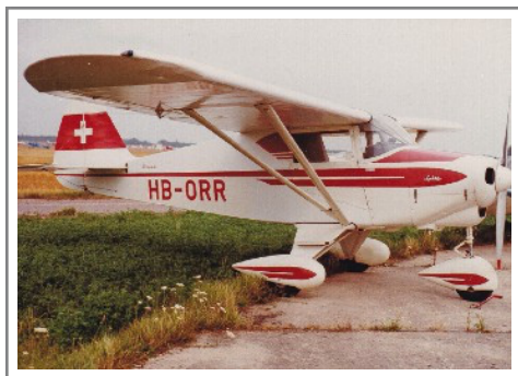
HB-ORR Piper PA.22-108 Colt on 1 August 1981 Brienne Le Chateau.jpg