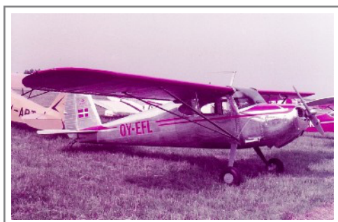
OY-EFL Cessna 140 on 5 June 1982 Stauning.jpg