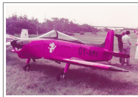
OY-AMV Jurca MJ.2 Tempete on 5 June 1982 Stauning.jpg