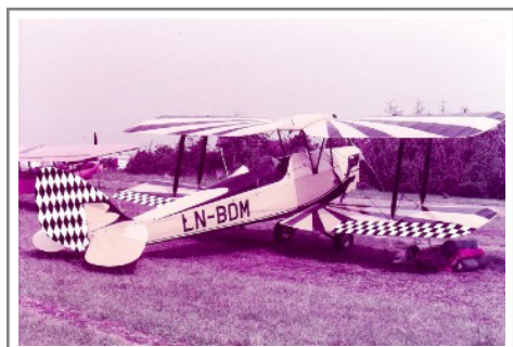
LN-BDM DH.82A Tiger Moth on 5 June 1982 Stauning.jpg