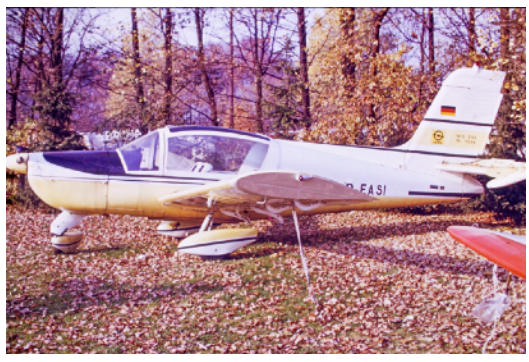
D-EASI Morans MS.894A-220 on 3 November 1973 Borkenberg.