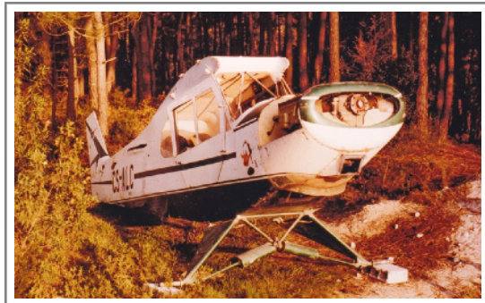
CS-ALC Paulistanha 56C-1 on 29 March 1983 Combra Portugal