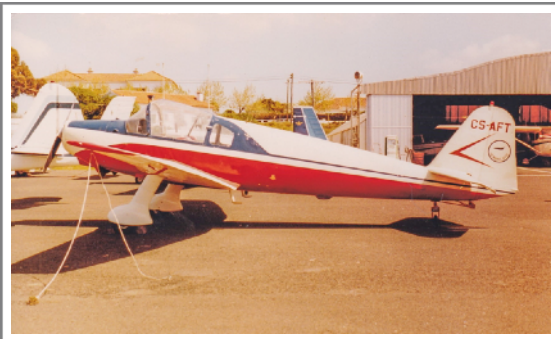
CS-AFT Klemm KI.107 on 30 March 1983 Cascais