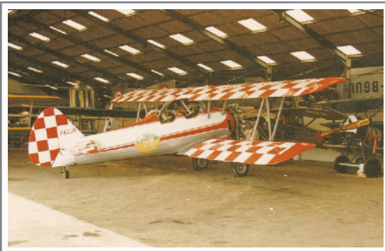
F-AZJR Boeing Stearman B.75N-1 on 6 June 1992 La Ferte Alais