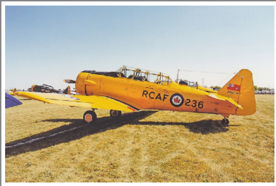
C-FGUY N.A.AT-6J Harvard IV on 30 July 1998 Oshkosh WI.