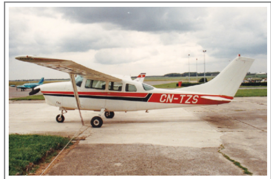
CN-TZS Cessna T.210 Centurion on 6 June 1992 Toussus Le Noble