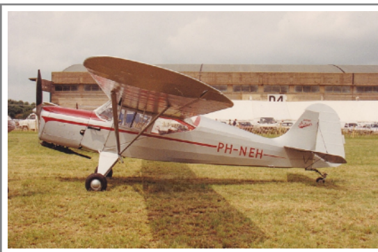
PH-NEH Auster J.5B Autocar on 4 July 1992 Wroughton