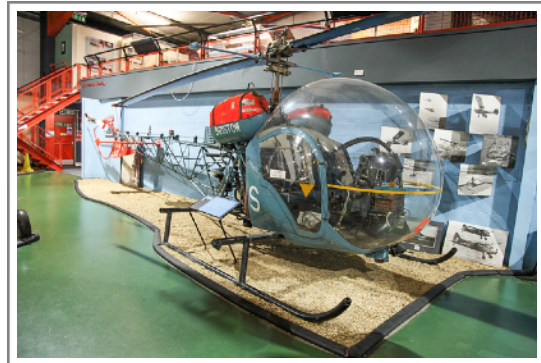
G-AXKS Westland Bell 47G-4 on 5 May 2012 Middle Wallop