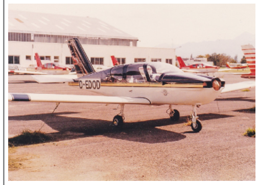
D-EDOD SOCATA TB-9 Tampico on 8 October 1981 Tarbes-Ossun