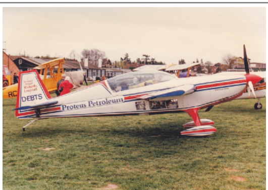
D-EBTS Extra EA.300 on 23 March 1990 White Waltham