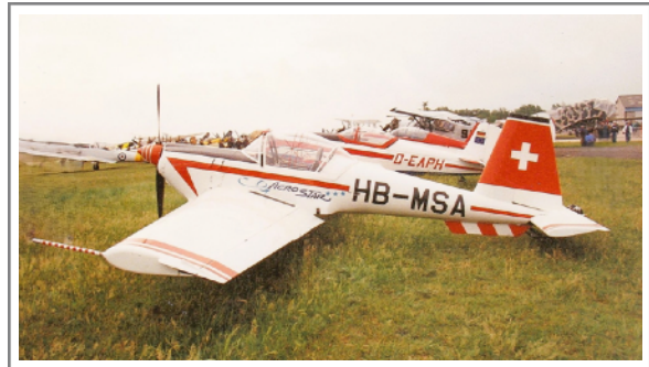
HB-MSA Hirth Hi 27 Akrostar II on 6 June 1992 La Ferte Alais