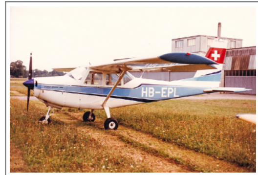
HB-EPL Partenavia P.64B Oscar 150