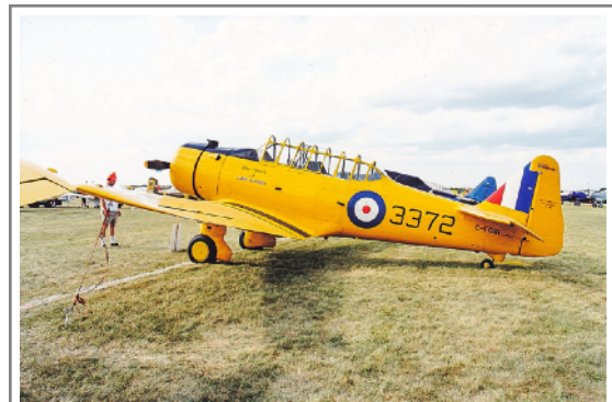
C-FGIR N.A.64 Yale on 30 July 1998 Oshkosh WI