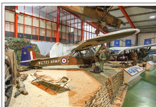
WZ721 Auster AOP 9 on 5 May 2012 Middle Wallop