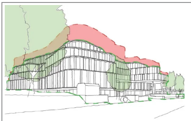
Sketch / image courtesy of HD Planning and Axis Mason.

The addition of a hotel in close proximity to the Club House will no doubt be an attraction for pilots and visitors and we will continue to keep members updated as the planning process moves forward.