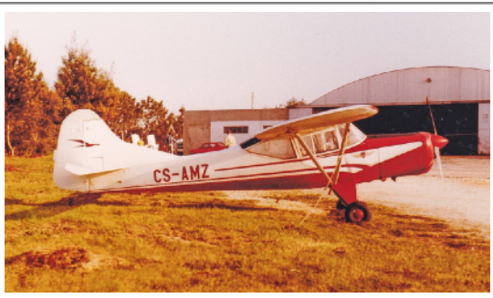
CS-AMZ Auster D.5-160 on 29 March 1983 Coimbra Portugal