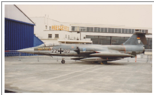
D-) 22+40 Messerschmitt built Lockheed F104G Starfligter on 22 July 1987 Le Bourget.jpg