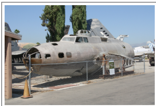
41-2446 (Swamp Ghost) Boeing B-17E Fortress on 19 September 2012 Chino.jpg