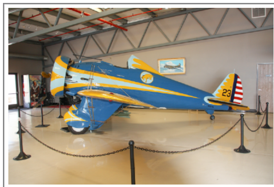
NX3378G (33-123) Boeing P-26A Pea Shooter on 19 September 2012.jpg