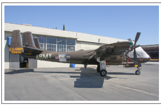
N4235Z 59604 Grumman OV-1B Mohawk. on 19 September 2012 Chino.jpg