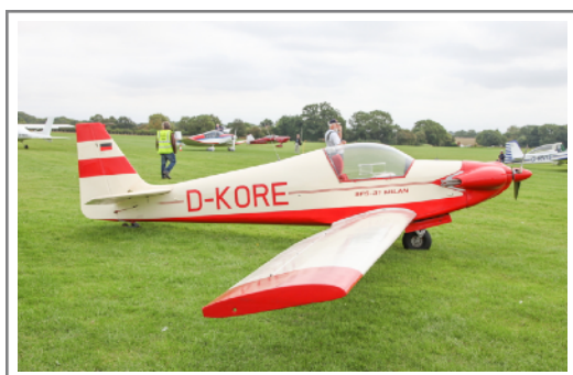
D-KORE Sportavia SFS.31 Milan on 1 September 2012 Sywell.jpg