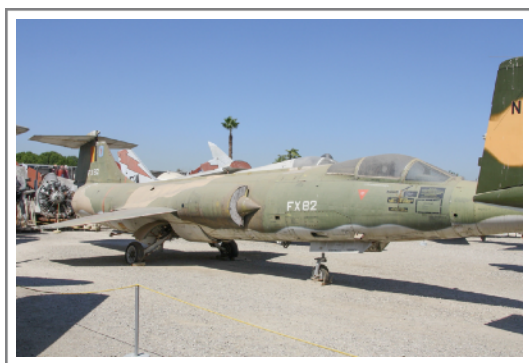
FX-82 SABCA built Lockheed F-104g Starfighter on 19 September 2012