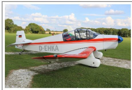
D-EHKA S.A.N.built Jodel DR.1050 Ambassadeur on 1 September 2017 Sywell.jpg