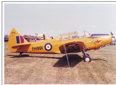
N49462 FH991 Fairchild PT-26 Cornell 30 July 1986 Oshkosh