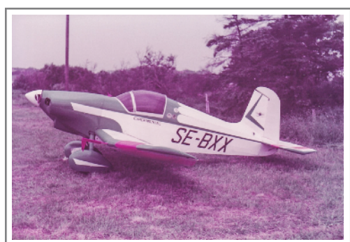
SE-BXX Andreasson BA-6 5 June 1982 Stauning