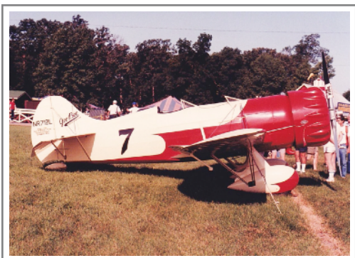
NR718L Granville Bee Gee Y Senior Sportster Replica 30 July 1986 Oshkosh