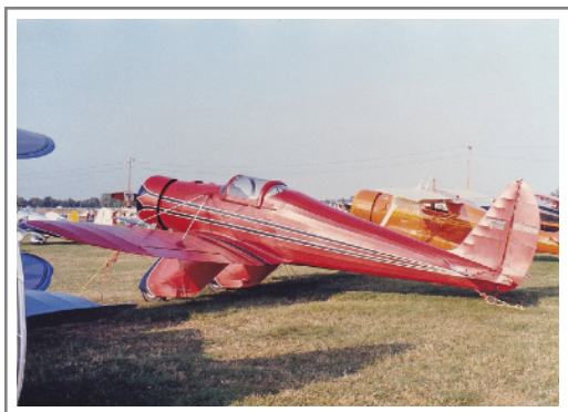
NC14919 Pasped Skylark W-1. 29 July 1986 Oshkosh