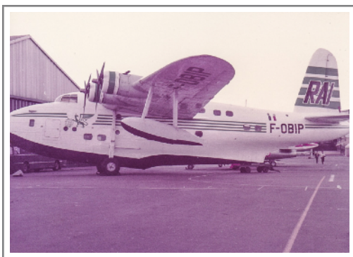
F-OBIP Short S.25 Sandringham 7 27 July 1979 Le Bourget