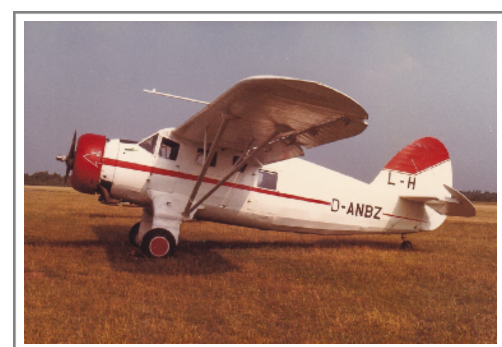
F-AZBN (D-ANBZ) Noorduy C-64 Norseman 4 27 August 1982 La Ferte Alais