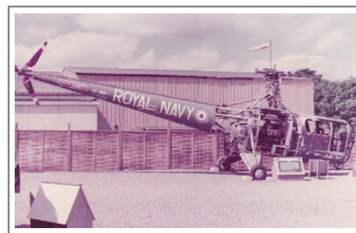
VZ962 Westland WS.51 Dragonfly HR.1 29 June 1984 Helston