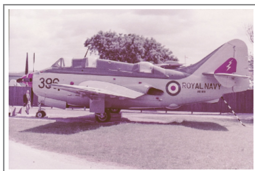
XG831 Fairey Gannet ECM.6 29 June 1984 Helston