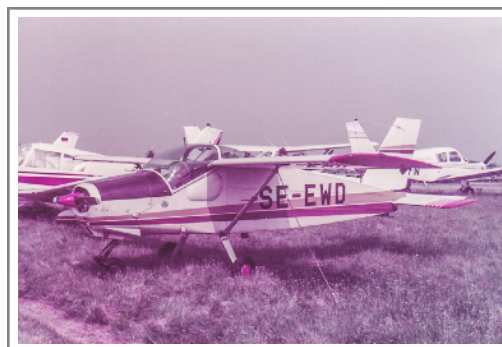
SE-EWD Malmo MFI-9B Trainer 5 June 1982 Stauning