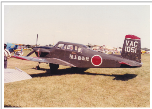
N2105N Fuji LM-2 Nikko 30 July 1986 Oshkosh