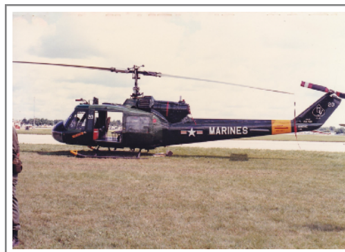
N9678Z 154818 Bell UH-1E Iroquois 30 July 1986 Oshkosh