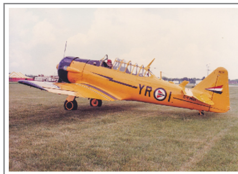
C-FMGI (7525) Noorduyn AT-16 Harvard IIB 30 July 1986 Oshkosh