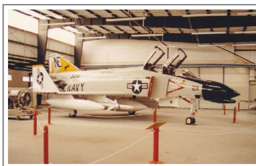
N ) 153016 McD F-4N Phantom II 30 October 1992 Mesa-Falcon Field