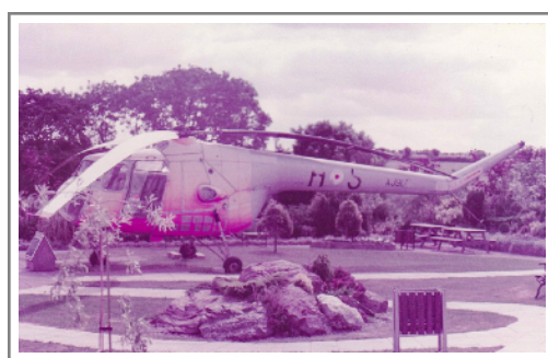
XJ917 Bristol 171 Sycamore HR.14 29 June 1984 Helston