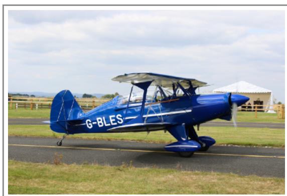
G-BLES Stolp SA.750 Acroduster Too on 30 August 2024