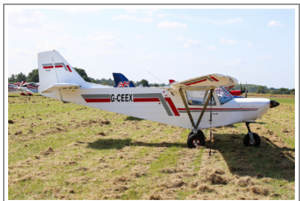
G-CEEX ICP MXP-740 Savannah Jabiru on 30 August 2024