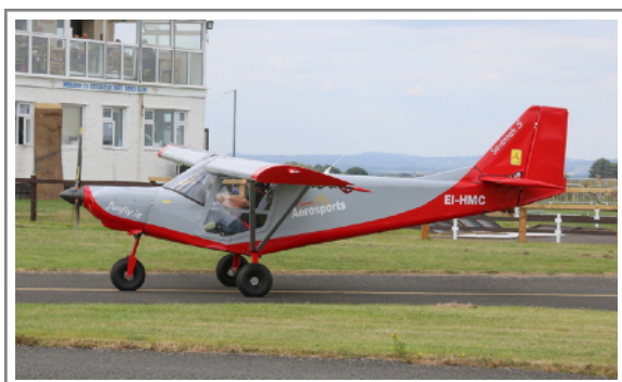
EI-HMC ICP MXP-740 Savannah S on 30 August 2024