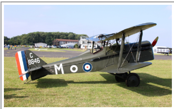
G-AVOU C8846 Slingsby T-56 SE.5A Replica on 31 August 2024