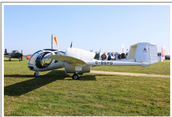
G-BOPO FLS Aerospace OA.7 Optica 301 on 30 August 2024