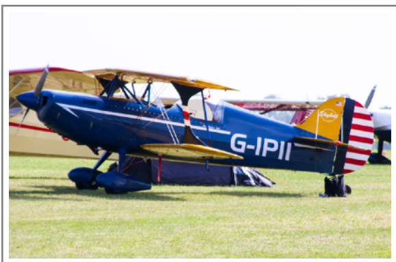
G-IP11 Steen Skybolt on 31 August 2024