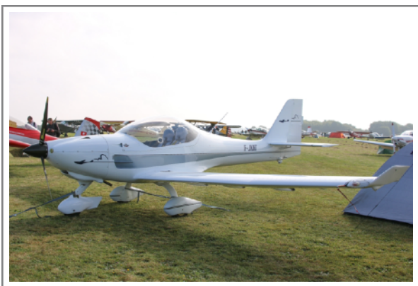
F-JKNT 71-TH B & F FK-14B Polaris on 31 August 2024