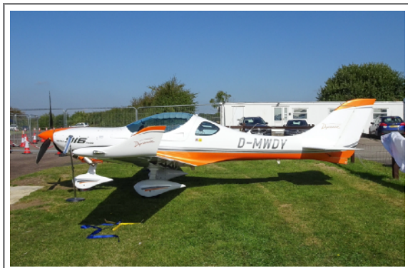
D-MWDY Aerospool WT-9 Dynamic on 30 August 2024

Part 2 of 2 - A Selection of images from LAA Rally 2024 at Leicester East