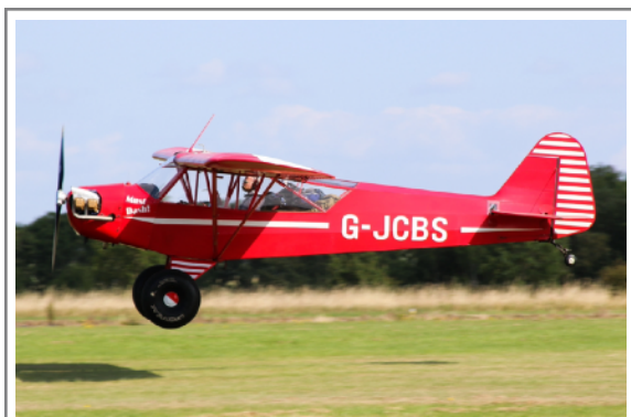
G-JCBS Piper J.3C-65 Cub on 30 August 2024