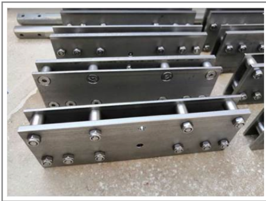
Bespoke stainless steel roller guides

As the test rollers installed on one door were a success, two weeks ago we upgraded all of the doors on the members hangar with floating rollers. In addition the top nuts which adjust the doors also used to move so these have been clamped with bespoke parts. As these solutions have been tested we are reasonably confident that sticking hangar doors are a thing of the past. This will eliminate emergency callouts and reduce maintenance costs moving forward.