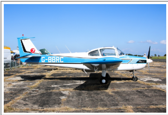
G-BBRC Fuji FA.200-180 Aero Subaru. on 30 August 2024