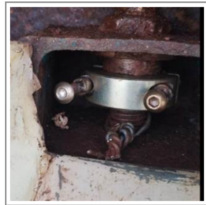
Bespoke locking collar