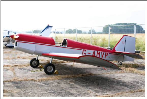
G-AMVP Topsy Junior on 31 August 2024