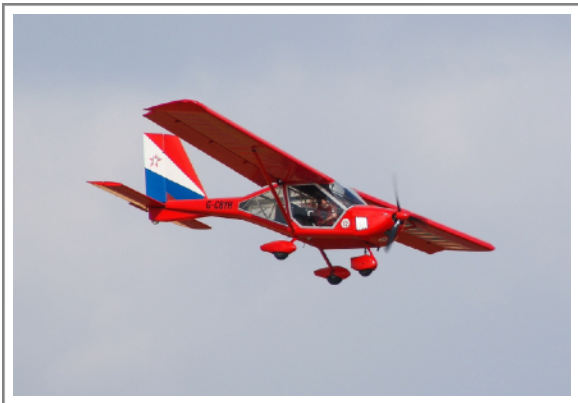
G-CBYH Aeroprakt A.22 Foxbat on 31 August 2024