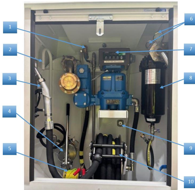
Figure 1 - Dispensing cabinet

11. Dispensing Equipment. The figures provide the layout and contents of the dispensing cabinets.