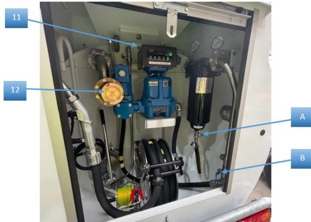
Figure 2 - Dispensing cabinet (contd.)