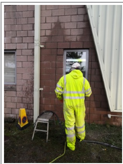
Diamond cutting the wall

Club members may have seen the smart glass curtain walling in the Flying Room which was installed and paid for by Ortac. As part of the Club's programme of improvements we obtained all necessary consents from POJL, Planning & Building Control for not only Ortac's upgrades but also for the Club to install a new independent entrance to CIASL as well as a significant upgrade to the Pilot Briefing Room which has been paid for by the Club