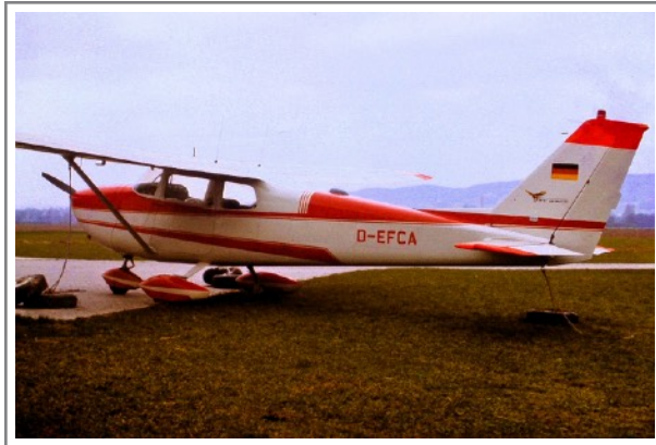
D-EFCA Cessna 172C Bad Oeynhausen 1973