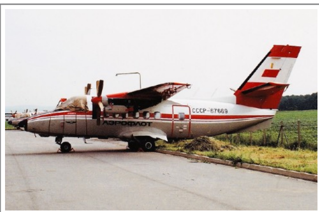
CCCP-67669 LET.410UVP-E on 16 June 1992 Kunovice