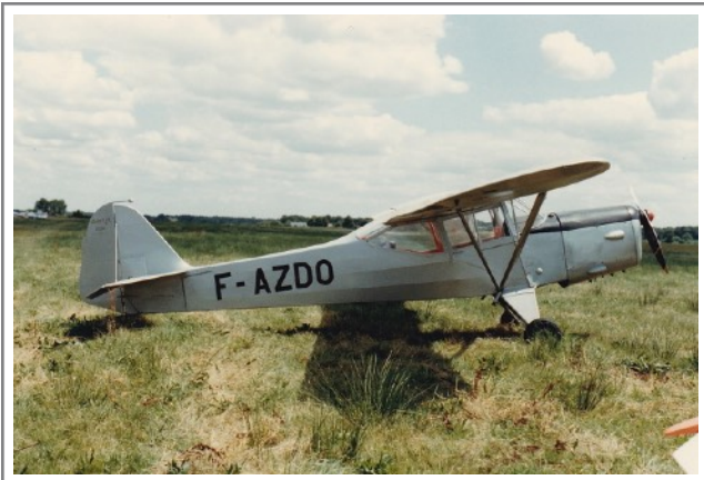
F-AZDO Auster J.1 Autocrat 26 July 1982 Brienne Le Chateau