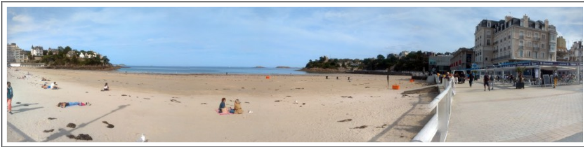
La grande plage

REMINDER - During the summer months, mandatory handling if you park on a hard standing. Only the landing fee applies if you park on the grass.