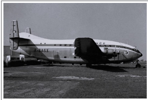
F-BASX Breguet B.763 Provence on 2 October 1973 Toussus Le Noble.