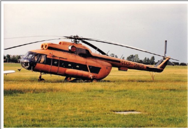
CCCP-25625 Mil 8T on 16 June 1992 Budaors