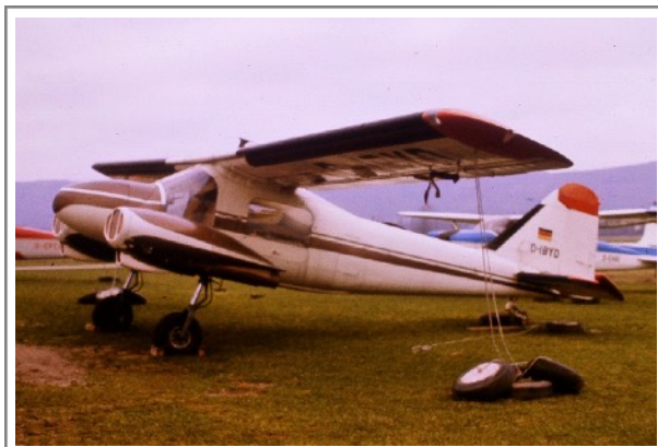
D-IBYD Dornier 28A-1 in 1973 Bad Oeynhausen