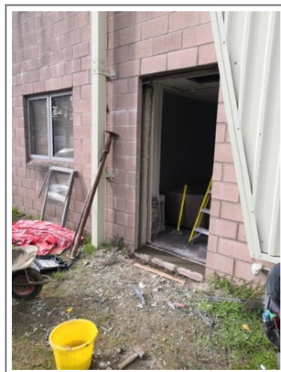
Preparing the cill & cavity