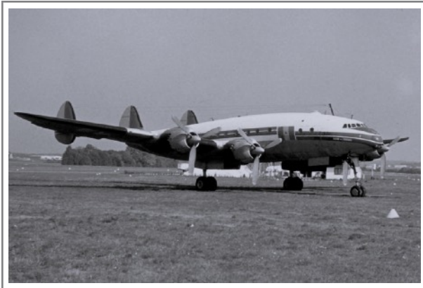
6V-AAR Lockheed L.749 Constellation on 2 October 1973 Toussus Le Noble