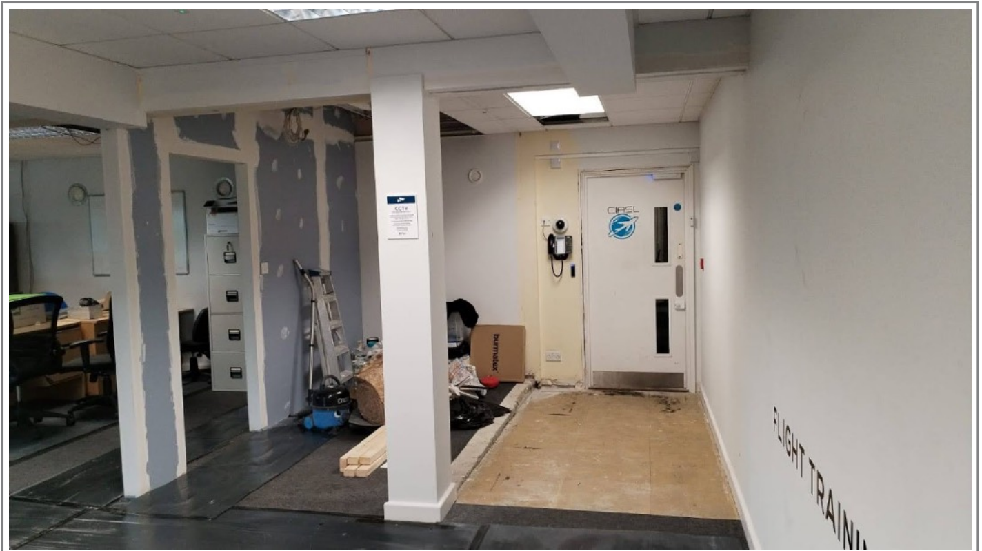
Work in progress

The committee obtained a quote from a local Building Contractor but, to keep costs as low as possible, we decided to go down the route of directly employing sub-contractors and buying materials at cost price. All of these projects will be completed at less than 50% of the quote price received. Many thanks to the Engineers in CIASL who have suffered disruption whilst these works have taken place.