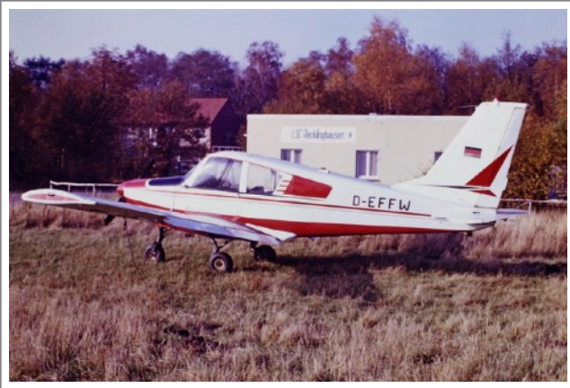
D-EFFW Sud Aviation built Gardan GY.80-150 Horizon on 3 November 1973 Borkenberg