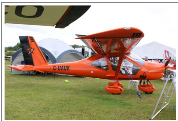
G-UAUK Aeroprakt A.32 Vixxen on 20 August 23 Popham