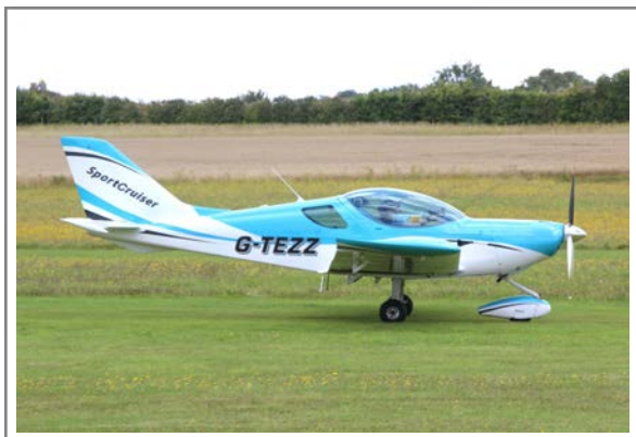
G-TEZZ CZAW Sportcruiser on 20 August 23 Popham