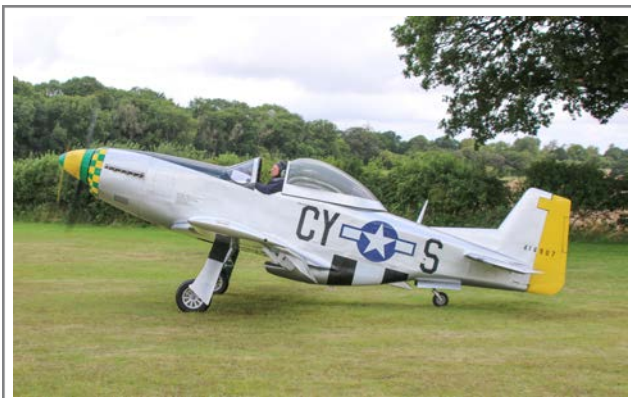
G-DHYS 414907 Titan T-51 Mustang