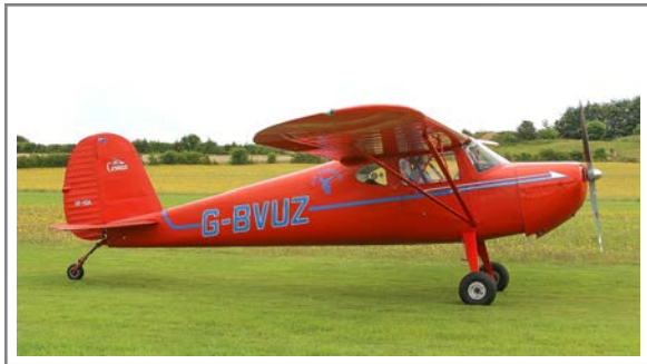
G-BVUZ Cessna 120 on 20 August 23 Popham