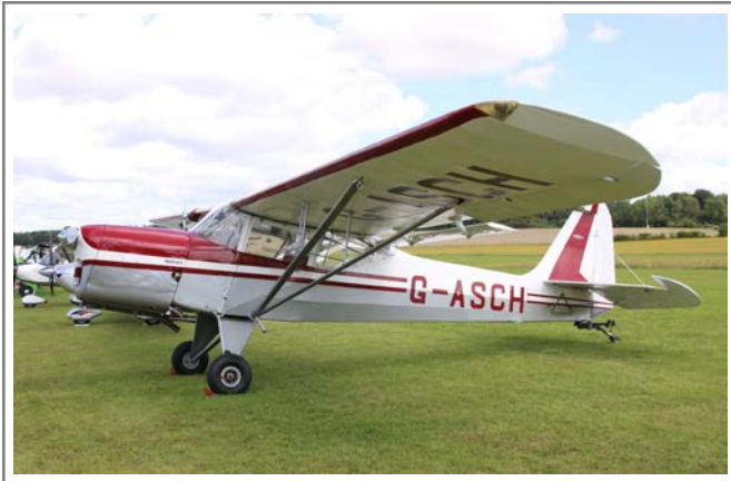
G-ASCH Beagle A.61 Terrier 2

Part two of two from the LAA Grass Roots Rally 2023 on 18-20 August 2023 at Popham.