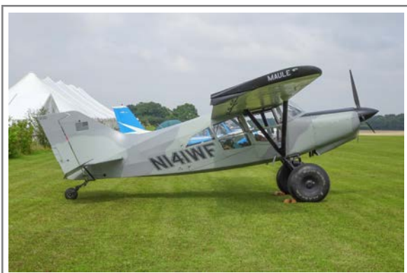
N141WF Maule M.7-235 on 18 August 23 Popham