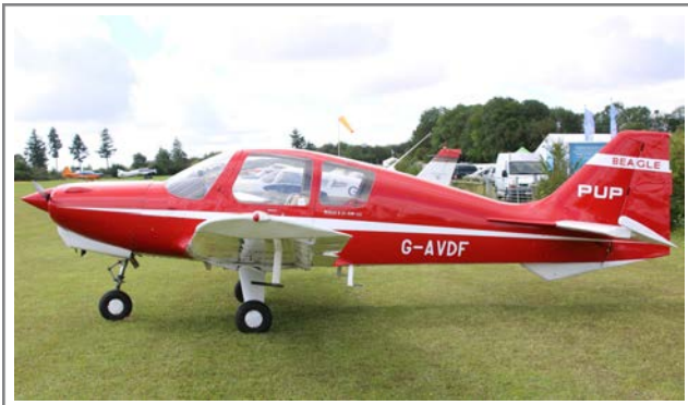
G-AVDF Beagle B.121 Pup 100