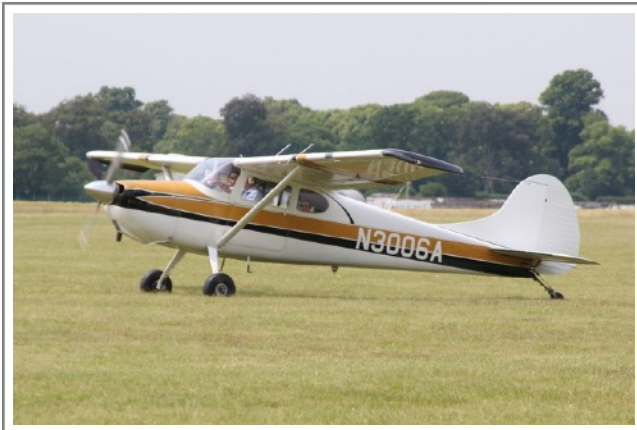
N3006A Cessna 170B 17 June 23 White Waltham