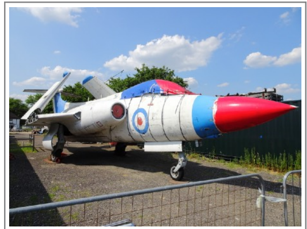
XN923 Blackburn Buccaneer S.1 16 June 23 Gatwick Aviation Museum Charlwood