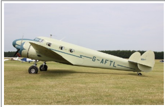
G-AFTL Lockheed 12A 17 June 23 White Waltham