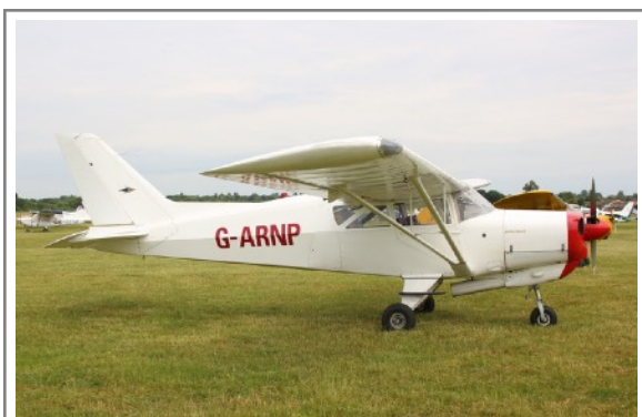
G-ARNP Beagle A.109 Airedale 17 June 23 White Waltham