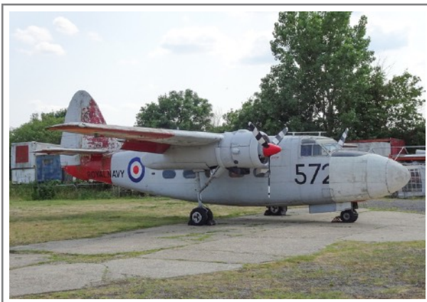
WP308 G-GACA Percival P.57. Sea Prince T.1 16 June 23 Gatwick Aviation Museum Charlwood