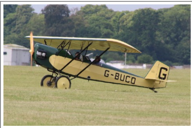
G-BUCO Pietenpol Aircamper 17 June 23 White Waltham