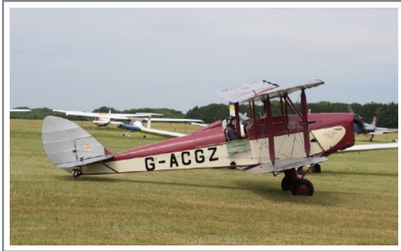
G-ACGZ DH.60G Moth Major 17 June 23 White Waltham.

Air-Britain Fly-In at White Waltham on June 17th 2023 and 3 pictures from the Gatwick Aviation Museum At Charlwood.