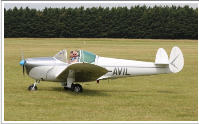
G-AVIL Alon A-2 Aircoupe 17 June 23 White Waltham