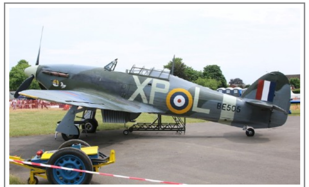
G-HHII BE505 Hawker Hurricane 10 17 June 23 White WG-SEDC