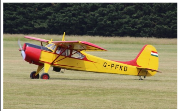
G-PFKD Yakovlev 12M 17 June 23 White Waltham