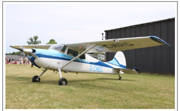
G-CMRG Cessna 170B 17 June 23 White Waltham