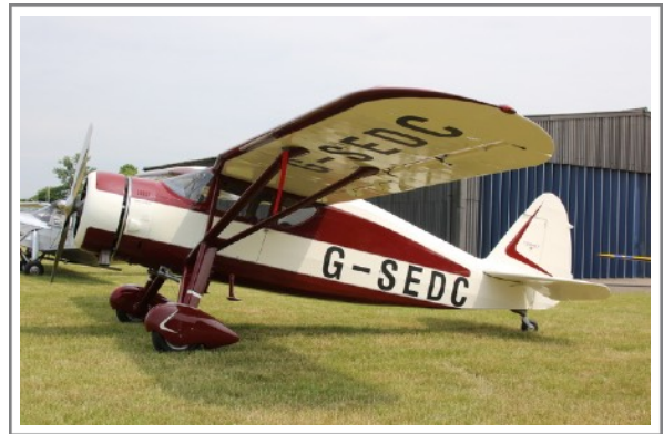
G-SEDC Fairchild F.24W-46 Argus 17 June 23 White Waltham