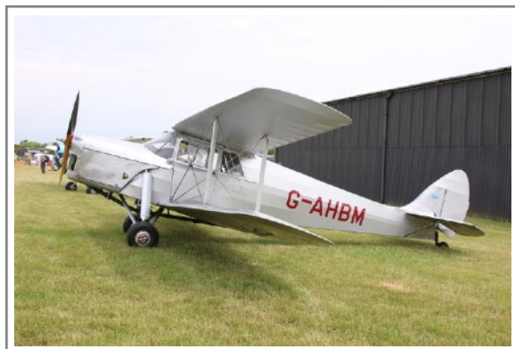
G-AHBM DH.87B Hornet Moth 17 June 23 White Waltham