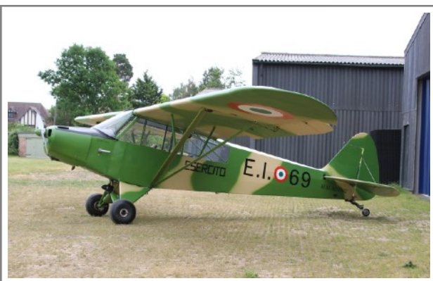
G-HELN MM52-2392 17 June 23 White Waltham