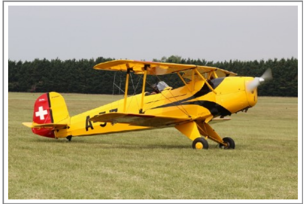
G-BECT U-57 CASA 1.131E Jungmann 17 June 23 White Waltham