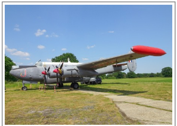
WR982 Avro Shackleton MR.3.3 16 June 23 Gatwick Aviation Museum Charlwood