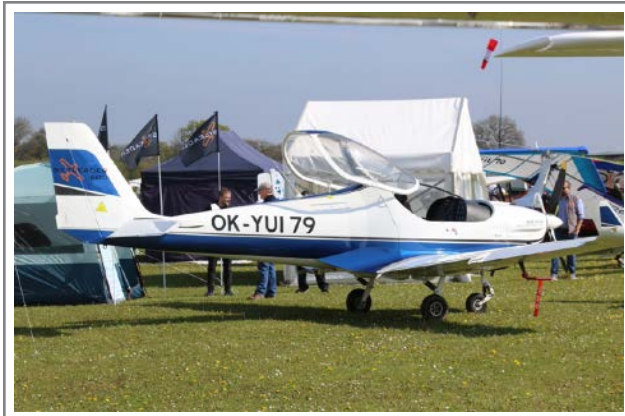
OK-YUI 79 Jihlaven Skyleader 600RG