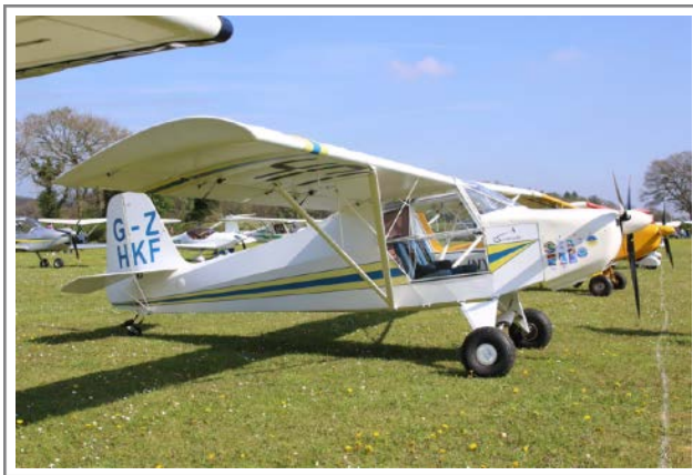
G-ZHKF Reality Escapade 912