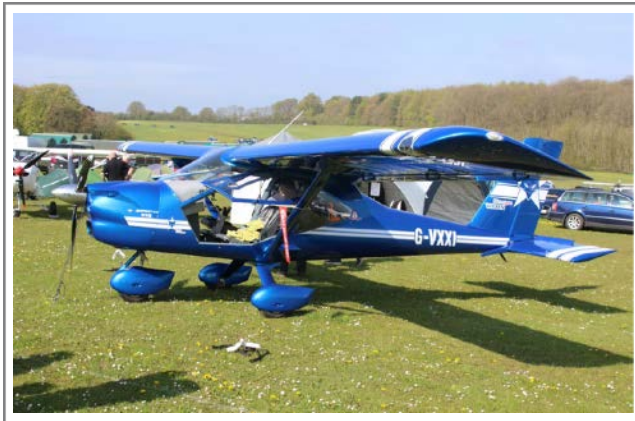
G-VXXI Aeroprakt A.32M Vixxen