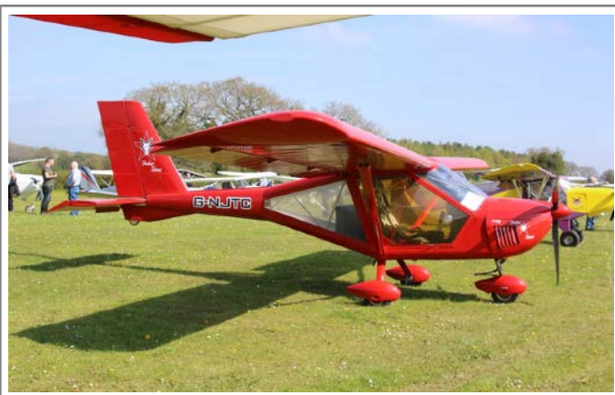
G-NJTC Aeroprakt A.22L Foxbat