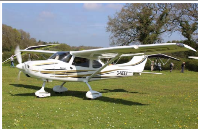
G-NEEV TL.3000 Sirius 600