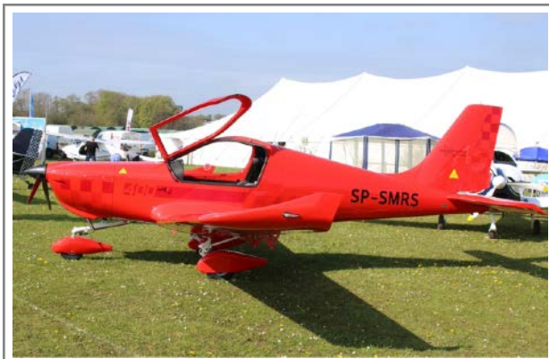
SP-SMRS Jihlaven Skyleader 400