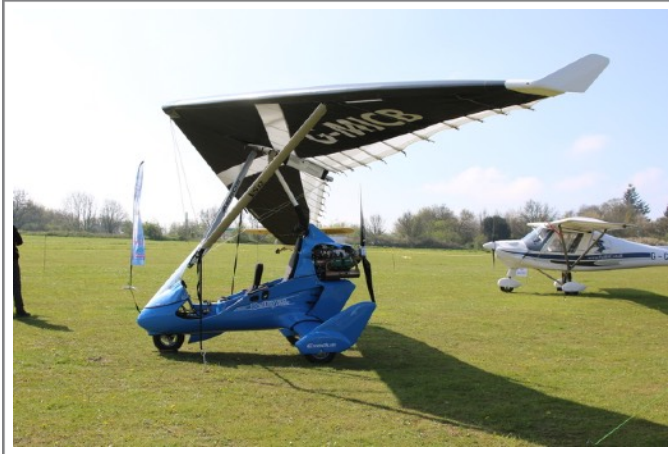
G-MICB Flylight Exodus Delta Jet 500 Stingray

Part two of two from Microlight Trade Fair 2023 at Popham on 29 April 23