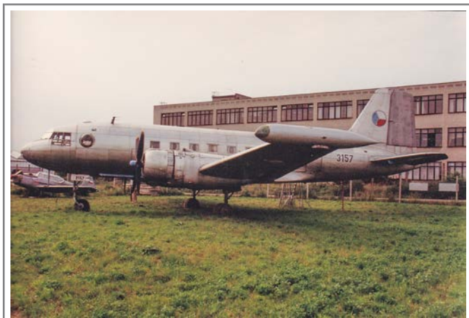
3157 Avia 14T (Ilyushin 14) 18 June 92 Kunovice