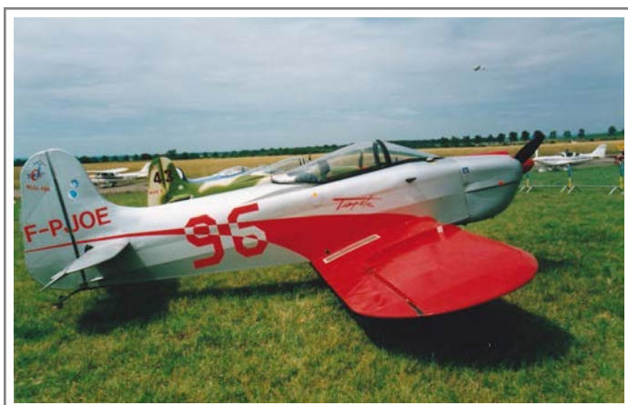
F-PJOE Jurca MJ.2E Tempete at RSA Rally Epinal 1997