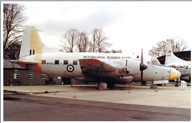
WF425 Vickers 648 Varsity T.1 29 June 75 Duxford.