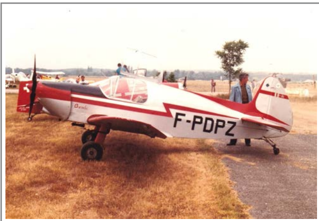
F-PDPZ Holleville RH.1 Bambi 1 August 87 at Brienne Le Chateau.