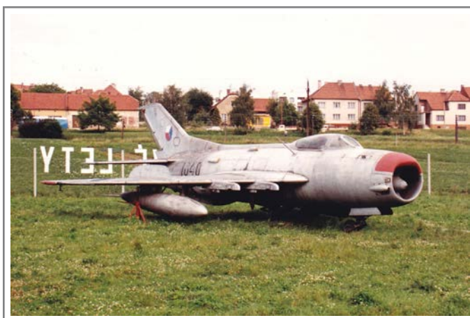
1040 Mig 19PM 18 June 1992 at Kunovice