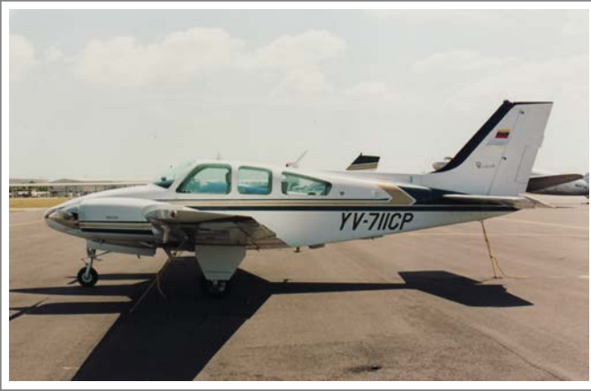
YV-711CP Beech B.55 Baron 7 March 99 Kendell Tamiami FLA.BMP