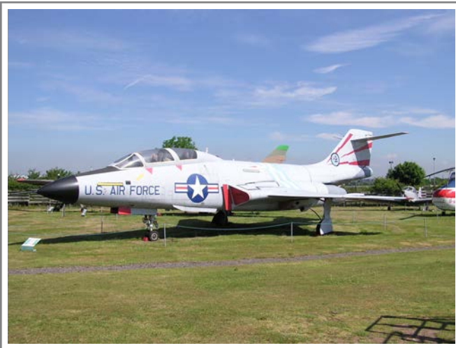
56-0312 Mc Donald F101F Voodoo 28 June 2005 Bagington