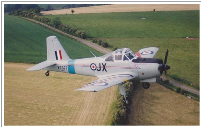
G-AWVF XF877 Percival P.56 Provost T.1 12 June 1994