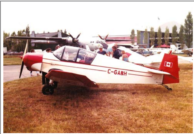
C-GABH Aero-Jodel built Jodel D.11A 30 July 82 at Brienne Le Chateau