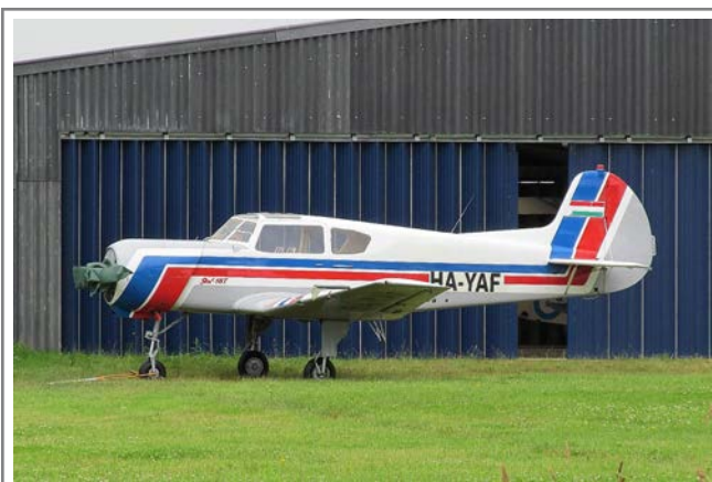
HA-YAF Yakovlev Yak 18T White Waltham 7 July 2012