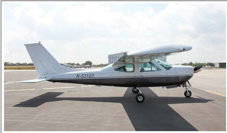
N53103 Cessna 177RG Cardinal at Cherbourg 6 July 2013