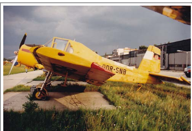
DDR-SNB Zlin Z.37-2 Cmelak 16 June 1992 Budaors