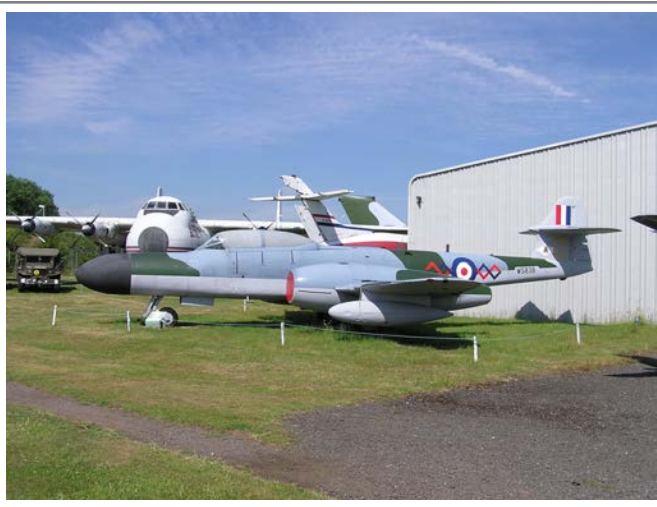
WS838 Gloster Meteor NF14 28 June 2005 Bagington