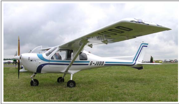
G-JUDD Avtech Jabiru UL-450 10 July 2004