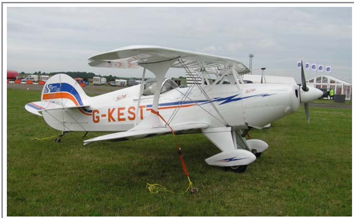
G-KEST Steen Skybolt 9 July 2004