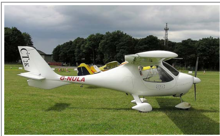
G-NULA Flight Design CT.2K 9 July 2004