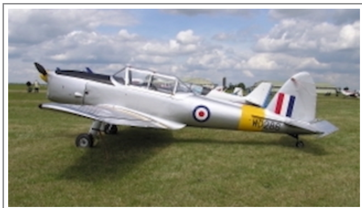
G-BBND WD286 DHC1 Chipmunk 9 July 2004