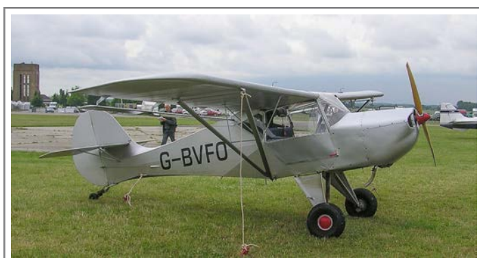
G-BVFO Avid Speed Wing 10 July 2004