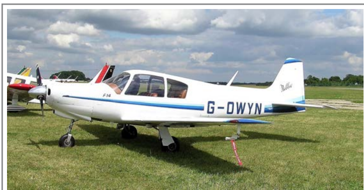
G-DWYN Aviamilano F.14 Nibbo 9 July 2004