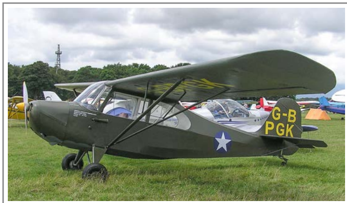
G-BPGK Aeronca 7AC Champion 10 July 2004

Part one of two - Kemble's LAA Rally 2004