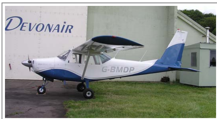
G-BMDP Partenavia P.64B Oscar 200 9 July 2004