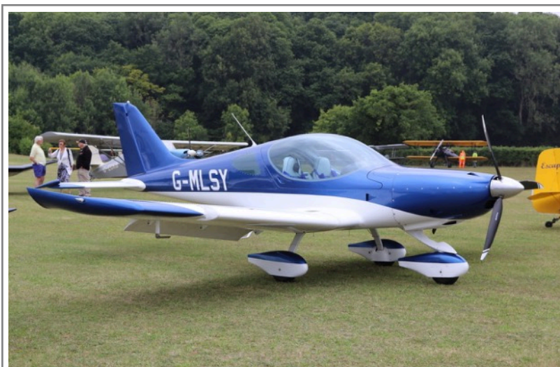
G-MLSY BRM Aero Bristell NG-5 Speedwing