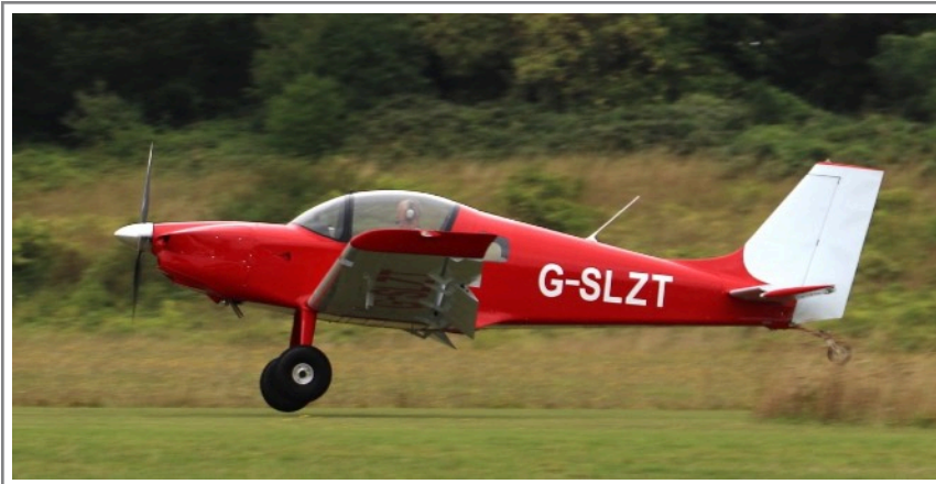
G-SLZT Aircraft Factory Sling 2