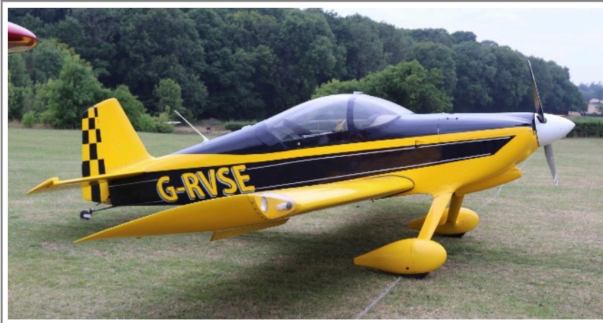
G-RVSE Van's RV-6