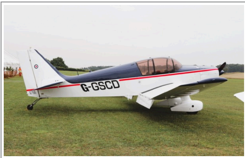
G-GSCD S.A.N. built Jodel D.140E Mousquetaire IV