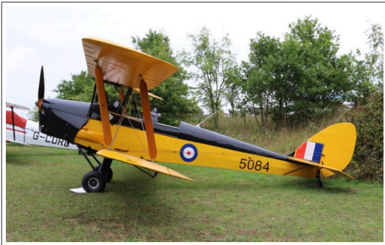
G-FCTK 5084 DH.82C Tiger Moth

Part 2 of 2 - LAA Grass Roots Fly In at Popham on 2,3,4 September 2022