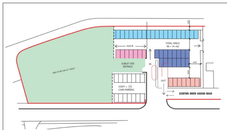
One of the many options to reconfigure the lower car park

Part of the income from leasing the lower car park will allow the Club to employ a part time manager who can work on boosting membership and organising flying and social events. We are a non-profit making entity so 100% of this extra income will be ploughed back into the Club and facilities.