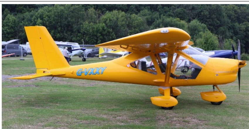
G-VXXY Aeroprakt A.32 Vixxen