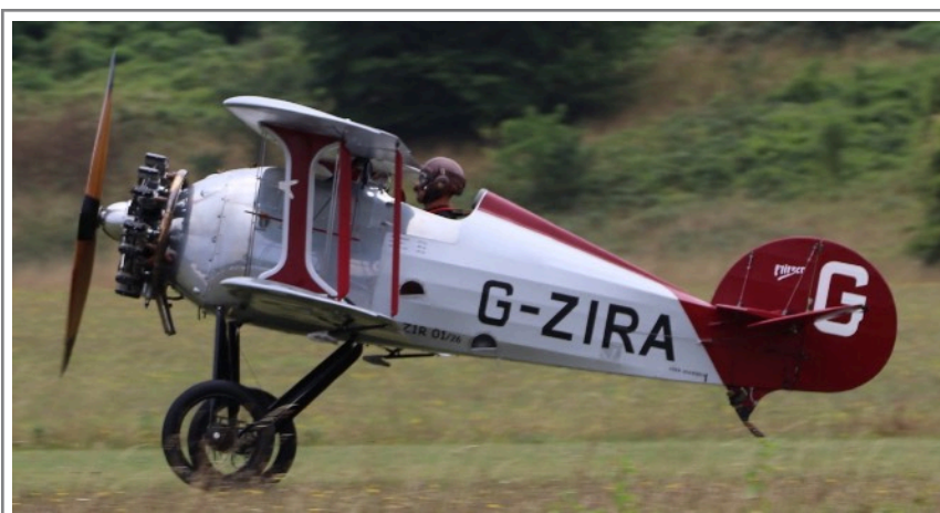
G-ZIRA Staaken Z.1RA Stummelflitzer