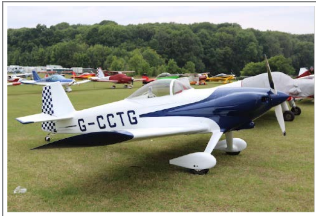
G-CCTG Van's RV-3B