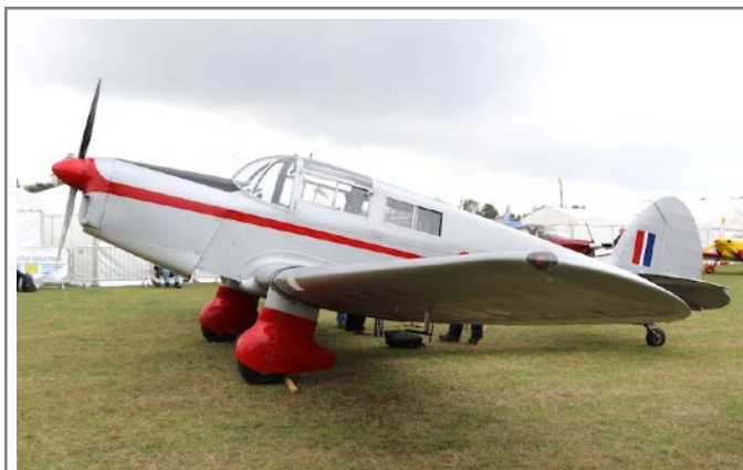
G-AKIU Percival P.44 Proctor V on 3 September 22 Popham