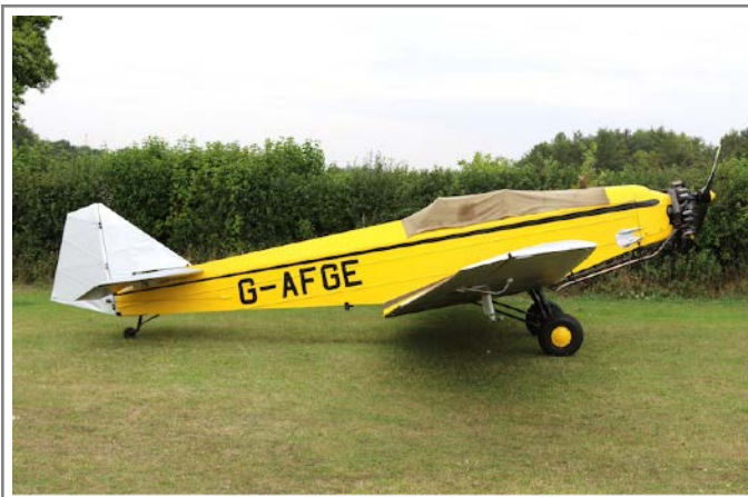
G-AFGE B.A. Swallow II on 2 September 22 Popham