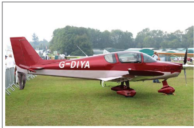
G-DIYA Aeroplane Factory Sling 4 TSI