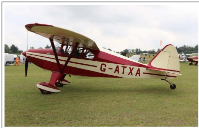
G-ATXA Piper PA.22-150 Caribbean