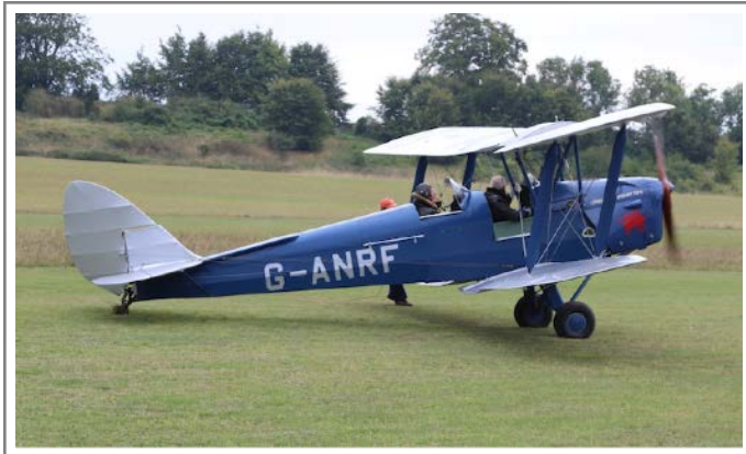
G-ANRF DH.82A Tiger Moth