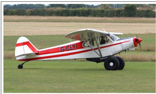
G-CLYI Piper PA.18-150 Super Cub