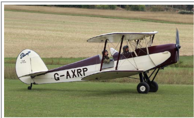
G-AXRP SNCAN built Stampe SV.4C