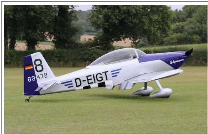
D-EIGT Van's RV-8 on 4 September 22 Popham