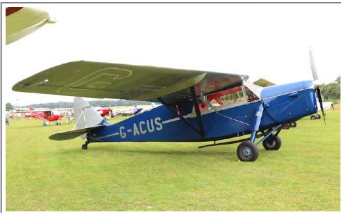
G-ACUS DH.85 Leopard Moth on 2 September 22 Popham