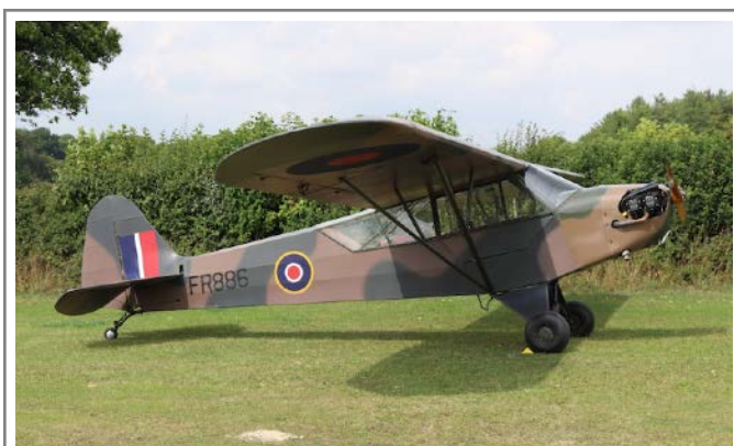
G-BDMS FR886 Piper J.3C-65 Cub