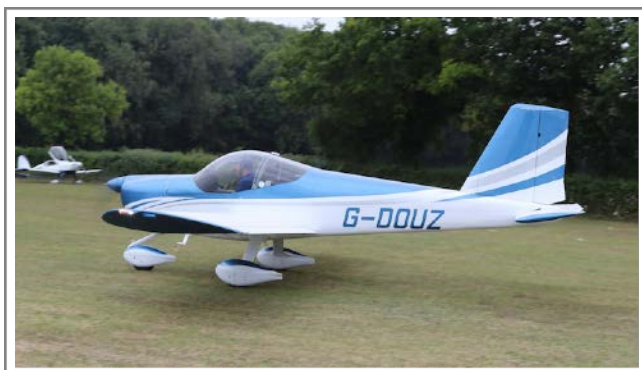
G-DOUZ Van's RV-12