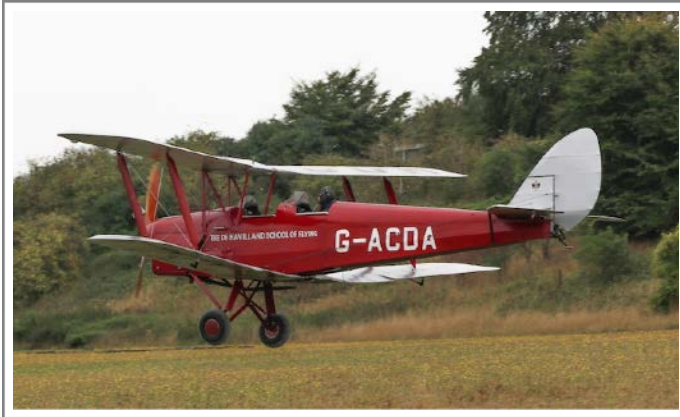
G-ACDA DH.82A Tiger Moth on 2 September 22 Popham