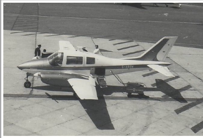
G-ARXM Beagle B.206Y 10 May 64 - Jersey