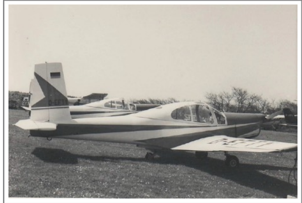
D-EFTY Orlican L-40 Meta-Sokol 10 May 64 - Jersey Rally