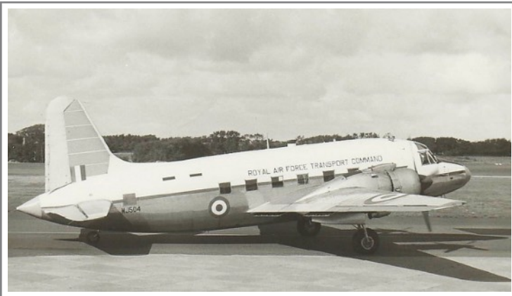
WJ504 Vickers Valetta C.2