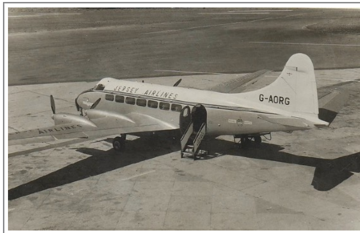
G-AORG DH114 Heron 2