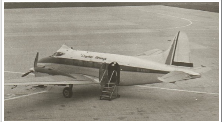
G-ANVU DH.104 Dove