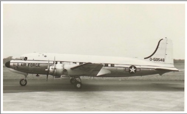
O-50546 Douglas C-54G Skymaster