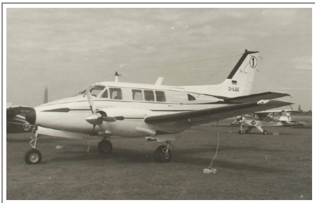
D-ILDE Beech 80 Queenair 7 May 65 - Jersey Rally