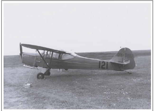
OY-DNU Auster J.1 8 May 1966 - Jersey Rally