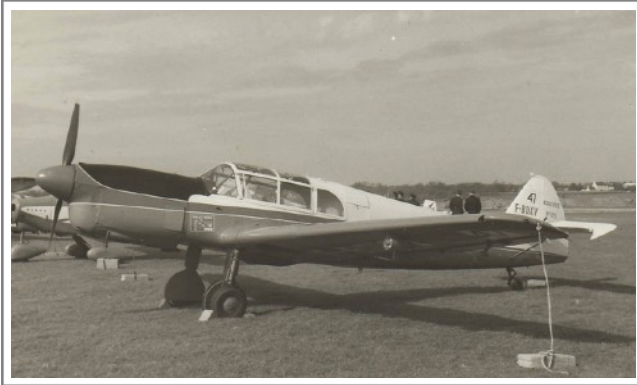
F-BDXV Nord 1002 Pingouin 7 May 65 - Jersey Rally