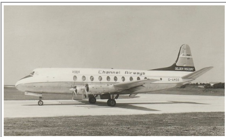
G-AMOO Vickers 701 Viscount