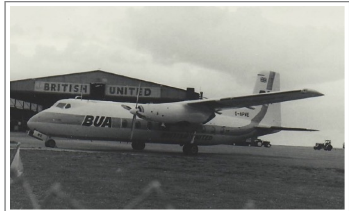
G-APWE Handley Page HPR.7 Dart Herald 201 - 1964