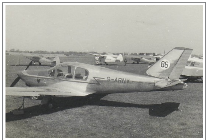
G-ARNV Procaer F.14B Picchio 12 May 63 - Jersey Rally