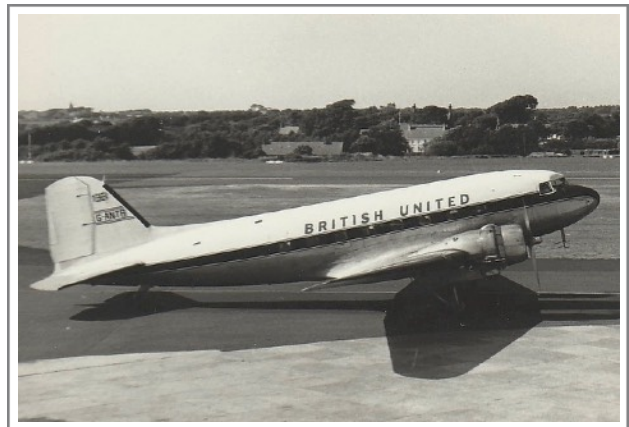
G-ANTB Douglas C-47B Dakota at Jersey early 1960's (Crashed Jersey 14 April 64)