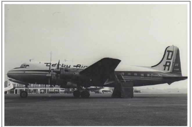
G-ALHY Canadair C.4 Argonaut