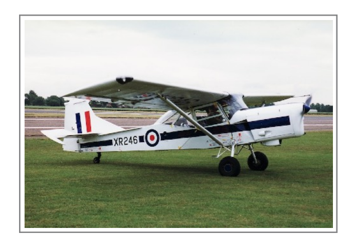
G-AZBU XR246 Auster AOP 9 PFA Cranfield July 1996