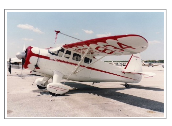
NC52834 Howard DGA-15P 7 March 1999 Kendell Tamiami