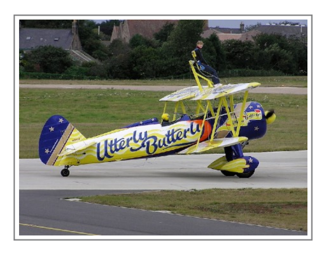
N74189 Boeing PT-17 Kaydet 10 September 2002 Jersey