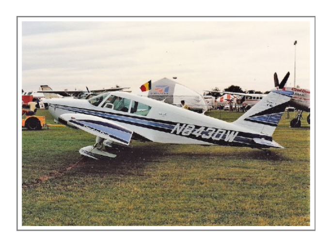
N8430W Piper PA.28-180 Cherokee Chief EAA Oshkosh 1986