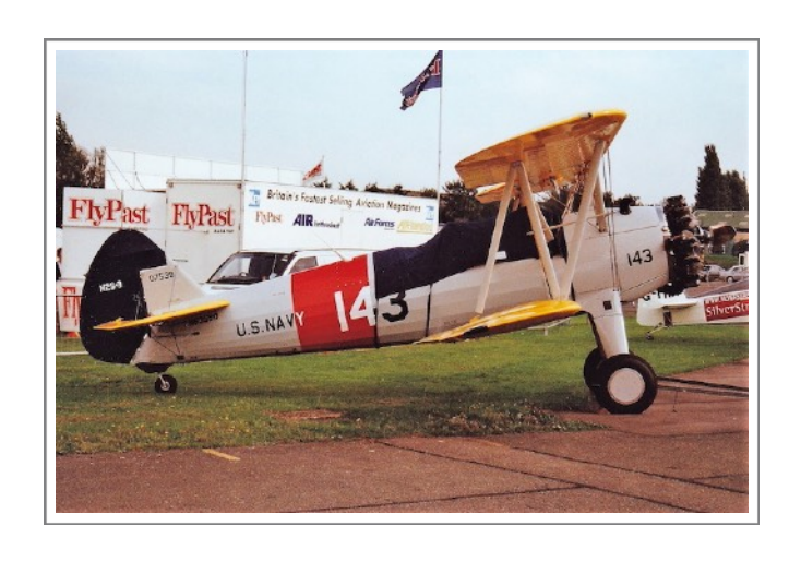
N63590 Boeing N2S-3 Stearman 24 September 2000 North Weald