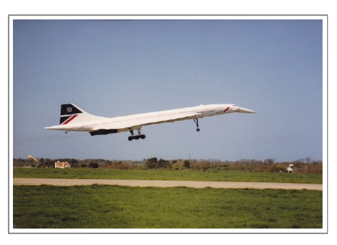
G-BOAB BAC Concorde 2 May 1987 Jersey