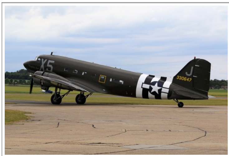
N62CC 330647 Douglas C47A Skytrain on 5 June 2019 Duxford

Second part of Bob's selection of images taken at "Dakotas over Duxford" on 5 June 2019.