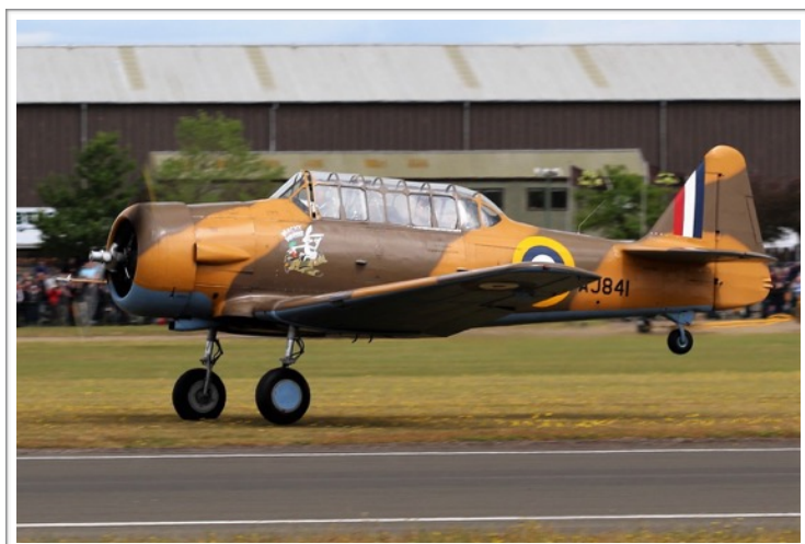
G-BJST AJ841 Canadian Car Foundries built NA T-6J Harvard 4 on 5 June 2019 Duxford.