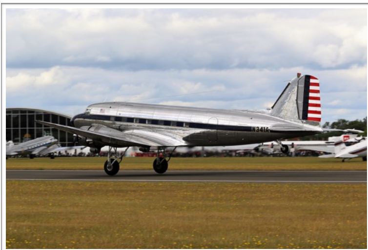
N341A Douglas C41A on 5 June 2019 Duxford