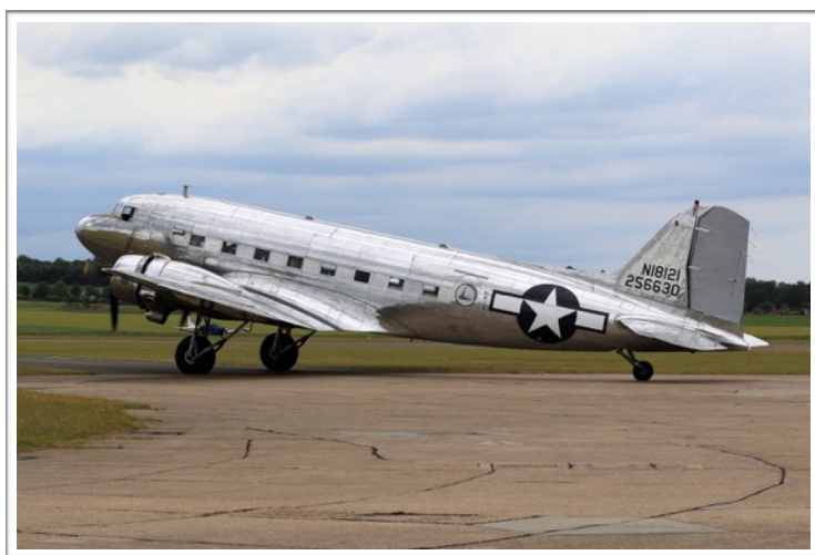
N18121 256630 Douglas C49A on 5 June 2019 Duxford