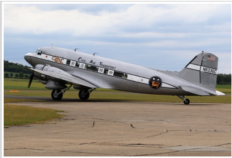
N8336C Douglas C53D Skytrooper on 5 June 2019 Duxford