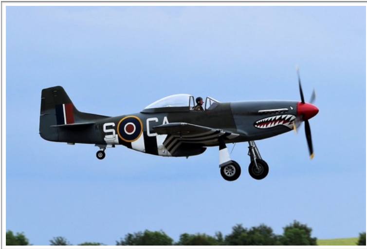
G-SHWN KH774 NA P51D Mustang on 5 June 2019 Duxford.