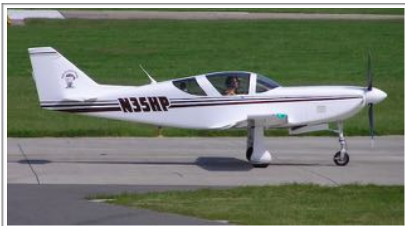
N35HP Stoddard Hamilton Glasair III RG Jersey 28 May 2005 Jersey