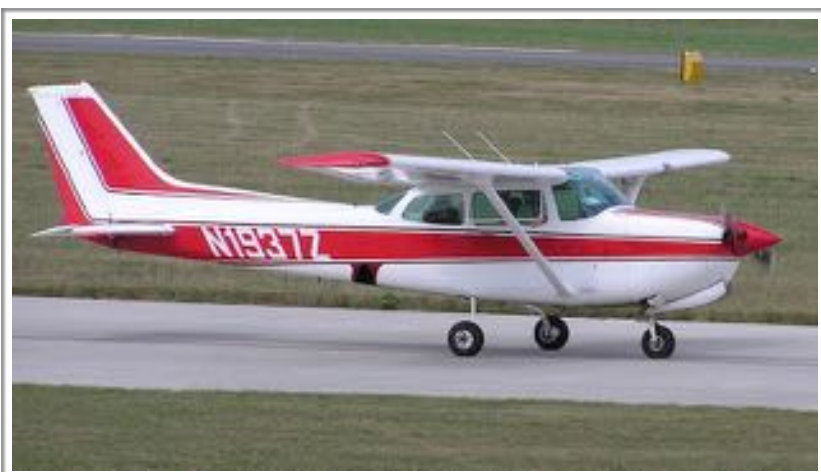
N1937Z Cessna 172RG Cutlass on 16 August 2003 Jersey