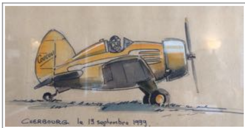
Above - a very well known table mat - Le Coucou de Fourchette.