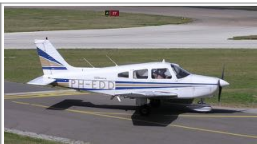
PH-EDD Piper PA28-161 Warrior II on 20 August 2003 Jersey