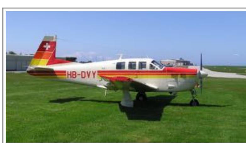
HB-DVY Mooney 22 Mustang