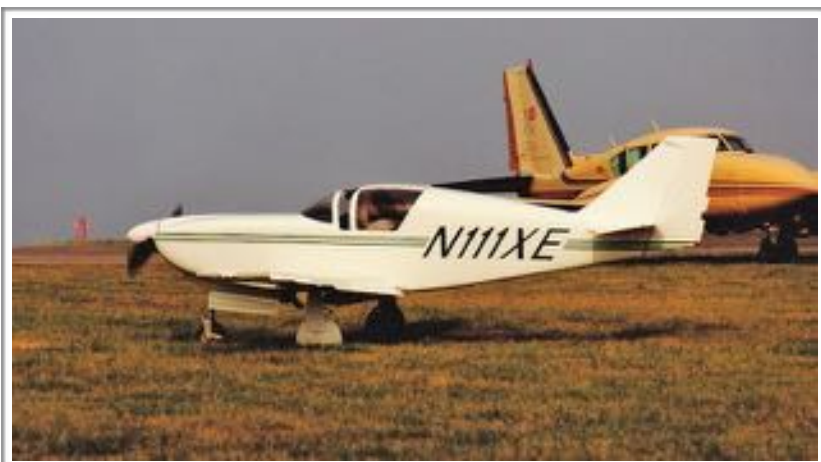
N111XE Stoddard-Hamilton Glasair IRG on 31 May 1995 Jersey