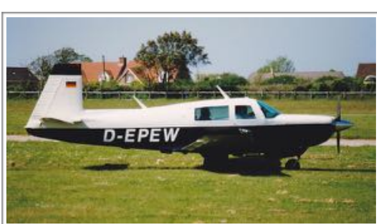
D-EPEW Mooney M20K