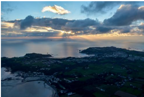
Johnny Kelly over St Aubins

The last two months of the year provided us a couple of crispy days for some sky time to remind us why we love it so much, sucking in the views on our scenic ride to altitude before the escape to freedom at the top.