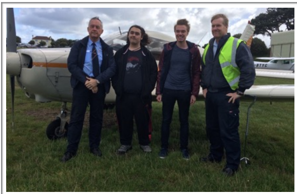
Air Display Team

September's weather has been highly changeable but we have managed to continue with our busy summer schedule, and we currently have 4 students rapidly approaching final skills test.