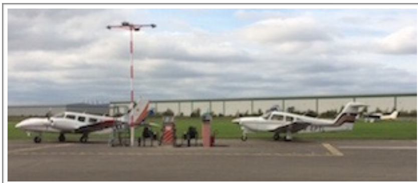
Waiting in turn for fuel

Having contacted Aberdeen they wanted me at FL70 to cross their airspace towards St Abbs I remained at 70 overhead Newcastle and Teeside before commencing a slow descent under the watchful eyes of the Leeming controller as he had a few Hawks and Tucanos training in the area. Eventually I transferred to Linton and they gave me a traffic service through the lower layers of cloud till I broke out below at 1800feet. Sherburn were using their tarmac strip 28 which with a southerly wind looked a bit short but I landed OK and taxied to the pumps for some fuel.