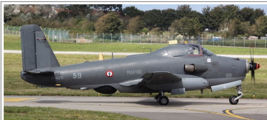
Breguet 1050 Alize