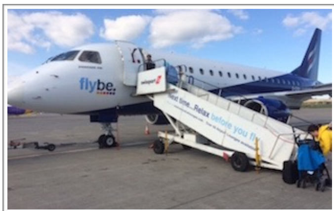
My transport from Edinburgh with about 15 other pax!

I checked the flights and Tuesday 19/9 was mutually convenient for everyone etd Jersey 1230 Flybe Dash8 eta Edinburgh 1430 and Eastern E170 etd 1530 to Sumburgh eta 1630 where the owner would meet me and take me to the aircraft for a look over and then to a hotel for the night.