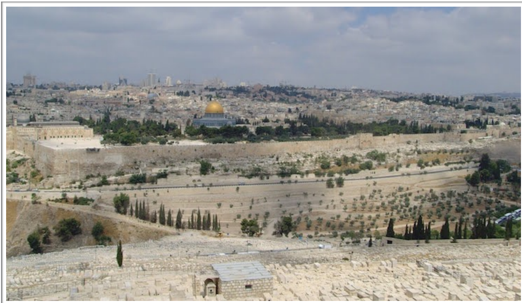
First views of Jerusalem

A three-hour flight took us to Rhodes. This was the only leg of our trip where we encountered bad weather, including isolated CBs. We had planned FL100 but this would have meant being in icing cloud all the time, so we progressively climbed to FL140 and then had to weave around CBs. Many airlines on this frequency also asked ATC to turn left or right “to avoid build-ups”, with permission readily given. By the time I descended and approached Rhodes the weather had improved to CAVOK. On Rhodes we stayed at a relatively new but exceptionally well-endowed “K boutique” hotel in Ixea.