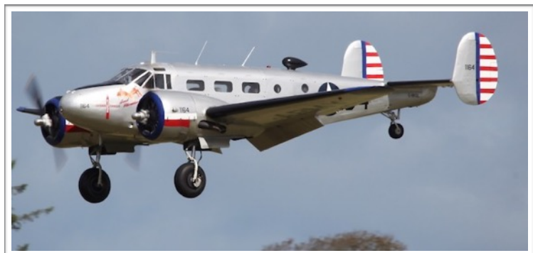
G-BKGL 1164 Beech 3TM