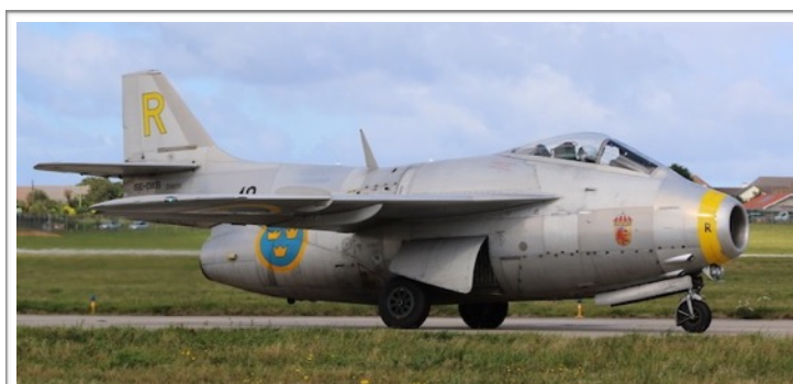
SE-DXB 29670 SAAB J29F Tunnen