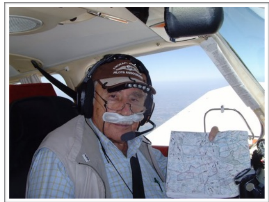
en-route IFR charts from Jeppesen. Note the unique AOPA cap with built in sunglasses and LED lights