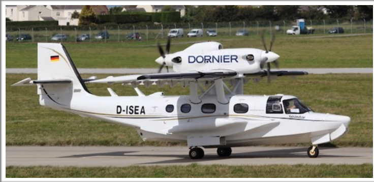
D-ISEA Dornier Seastar