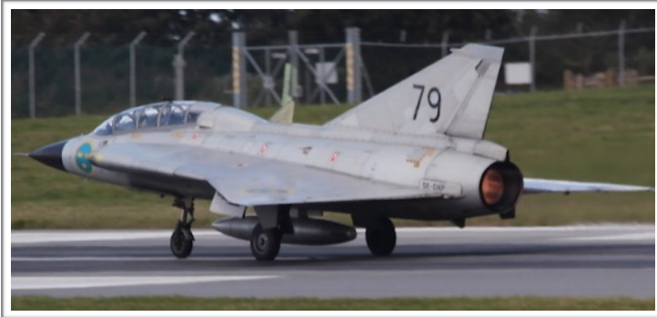
SE-DXP SAAB SK35C Draken

As mentioned last month, below are the remainder of the photos from Bob's Air Display images.