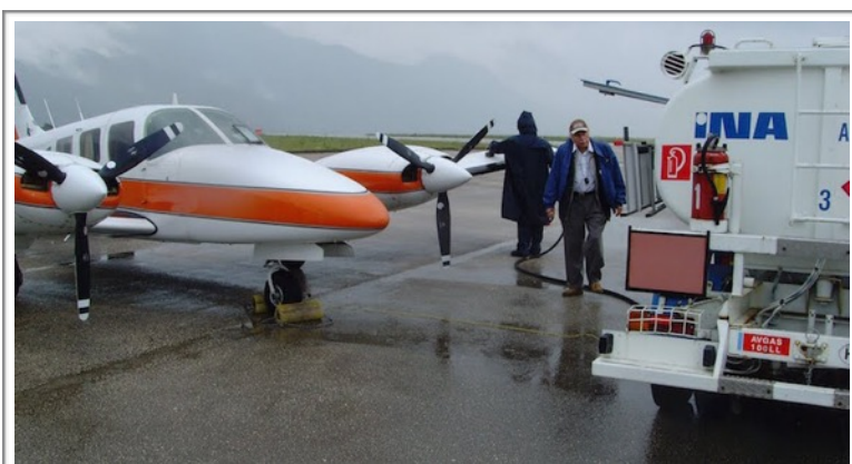
Dubrovnik. We always refuelled on arrival to avoid potential delays the next day.