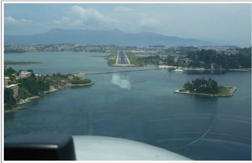
Finals into Kerira, Corfu

A three-hour flight took us to Rhodes. This was the only leg of our trip where we encountered bad weather, including isolated CBs. We had planned FL100 but this would have meant being in icing cloud all the time, so we progressively climbed to FL140 and then had to weave around CBs. Many airlines on this frequency also asked ATC to turn left or right “to avoid build-ups”, with permission readily given. By the time I descended and approached Rhodes the weather had improved to CAVOK. On Rhodes we stayed at a relatively new but exceptionally well-endowed “K boutique” hotel in Ixea.