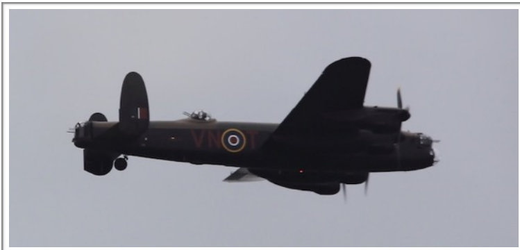
PA474 Avro Lancaster B1