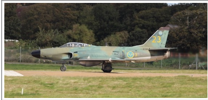
SE-RMD SAAB 32B Lansen