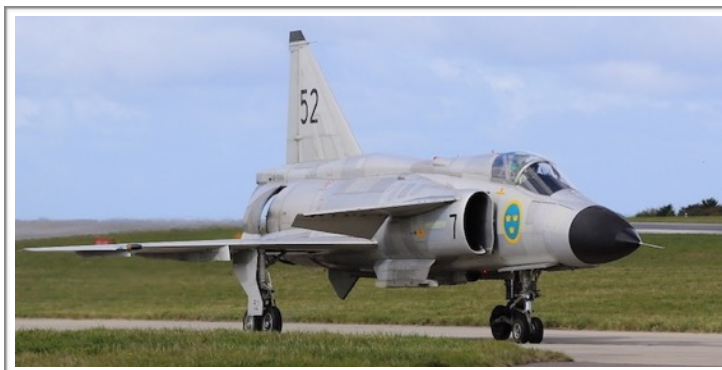
SE-DXN 37098 SAAB AJS37 Viggin