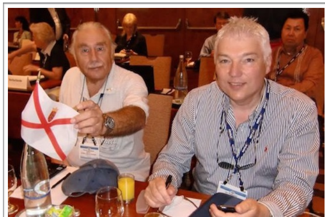
At the IAOPA World Assembly. Charles, as usual, flying the flag for Jersey.