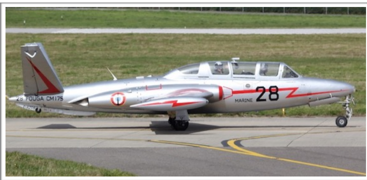
F-AZPF 28 Fougas CM175 Zephyr