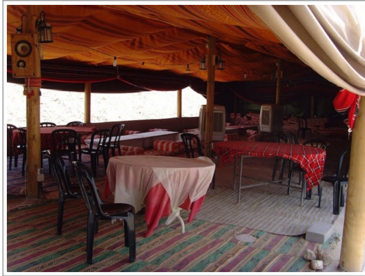
Masada's terminal building was a bedouin tent

The airport in Eilat is the most "town central" airport I have ever flown into in my 55 years of flying. We came in from the north having over flown the Negev desert and as it happens took off from the same runway over the sea with a very tight SID (standard instrument departure) to avoid flying over Jordan airspace next door. Eilat is a very popular international holiday resort with many high-rise and high price international hotels lining the coast and many sea and undersea amenities available. We stayed at the Nova hotel near the airport and enjoyed their swimming pool. The evening after our late afternoon landing we spent at a bazaar style market lining the beach of the Red Sea and finished at a seafood restaurant for dinner during which we had a dip in the Red Sea.