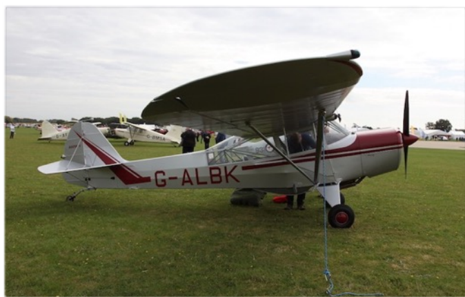
G-ALBK Auster 5 - 3/09/16