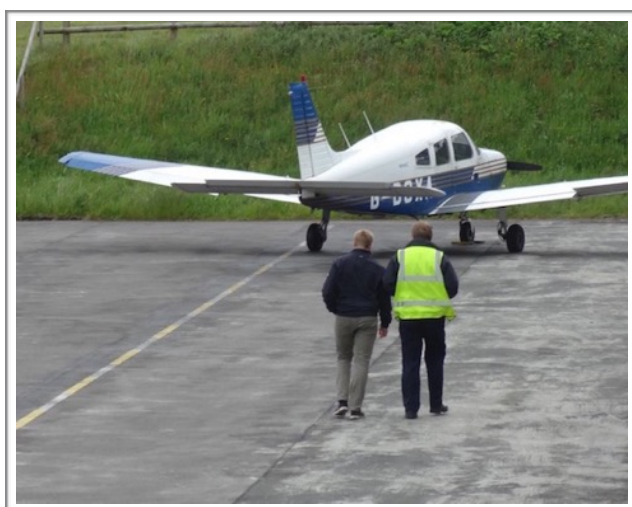
(left) from skills test with CFI James Evans to ATPL

Happy landings to you all, and hopefully I just might land at Jersey again some day