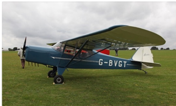
G-BVGT Crofton Auster J1A - 2/09/16