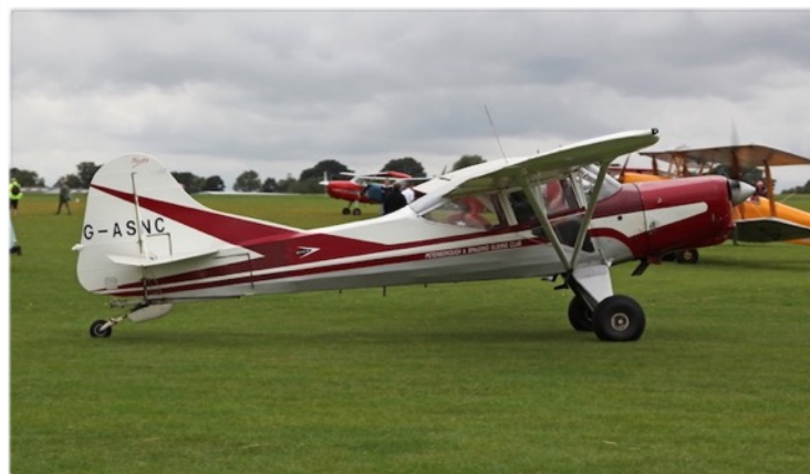
G-ASNC Beagle D5-180 Husky - 2/09/16