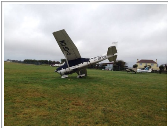
G-OFCM attempts pilotless flight!

Traditionally people can't seem to wait to see the back of January, but this year the prolonged cold and clear weather towards the end of the month was fantastic for flying! Even though it's the season for annual maintenance checks, the planes have been very busy. What a contrast to earlier in the month when we had some very windy days, one with gusts up to 65 knots that appeared unannounced. Only one aircraft was damaged (now back on line) and thank you to Graham from engineering and the fire service for their help turning all the aircraft on the grass parking area into wind to prevent further damage.