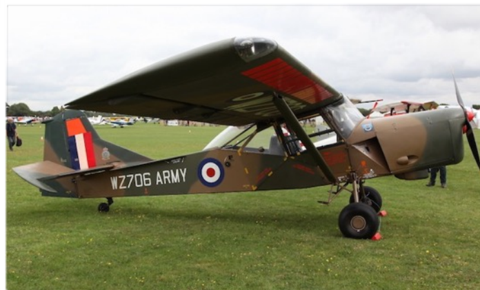
G-BURR WZ706 Auster AOP 9 - 2/09/16