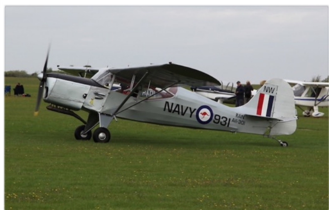
G-ARKG Auster J5G Autocar - 3/09/16