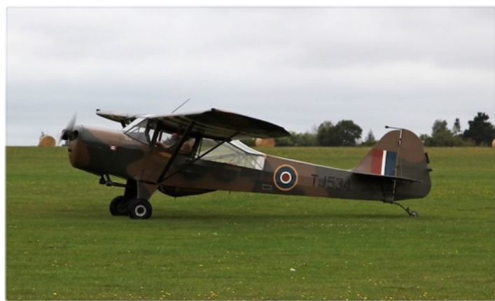
G-AKSY TJ534 Auster 5 - 2/09/16

Austers and variants at LAA Rally 2016 at Sywell on 2/3 September 2016