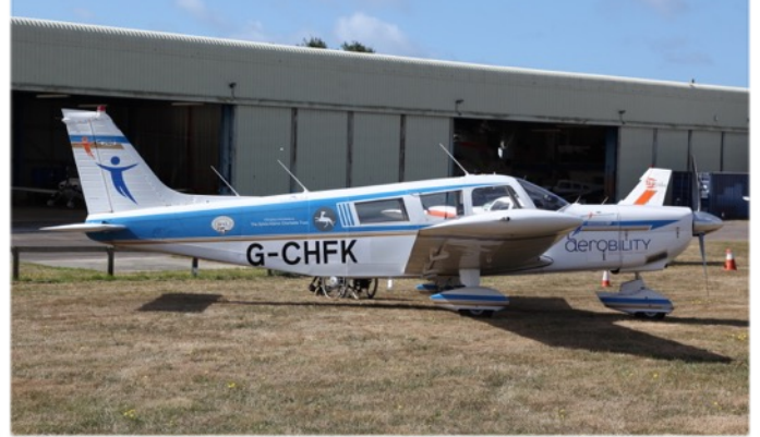
Aerobility - G-CHFK Piper PA32-260 Cherokee six 08/09/16