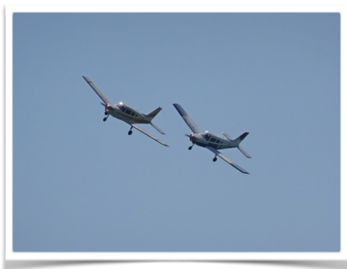
Helping Wings formation.

As the summer draws to a close, now would be a good time to check your licence and ensure everything is in date, and perhaps make a note of when your ratings expire. The old UK/JAA licence had individual pages with ratings and expiry dates clearly displayed, but unfortunately the new EASA licence that most of us now hold is not as clear. It requires you to pull the licence out of its wallet and closely inspect the tiny ratings boxes to check all is in order. I mention this as since the introduction of the EASA licence I have noticed an increase in pilots (inadvertently) allowing their Single Engine Piston (Land) ratings to expire. This is potentially serious as in the event of any kind of incident or accident your and your aircraft insurance will be invalid if the rating allowing you to fly the aircraft is expired. If you have any doubt at all about your licence/ratings, please feel free to pop in and see me and I'll check it all through with you, no charge!