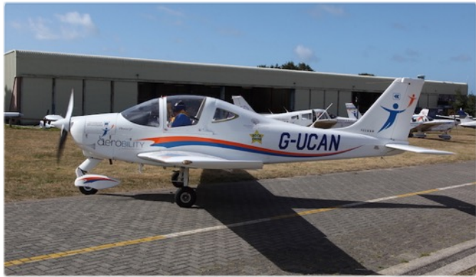
Aerobility - G-UCAN Tecnam P2002-JF sierra 08/09/16