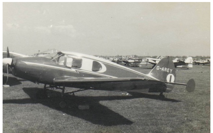
G-AREY Bellanca 14-13-2 Crusair, Jersey - May 1965