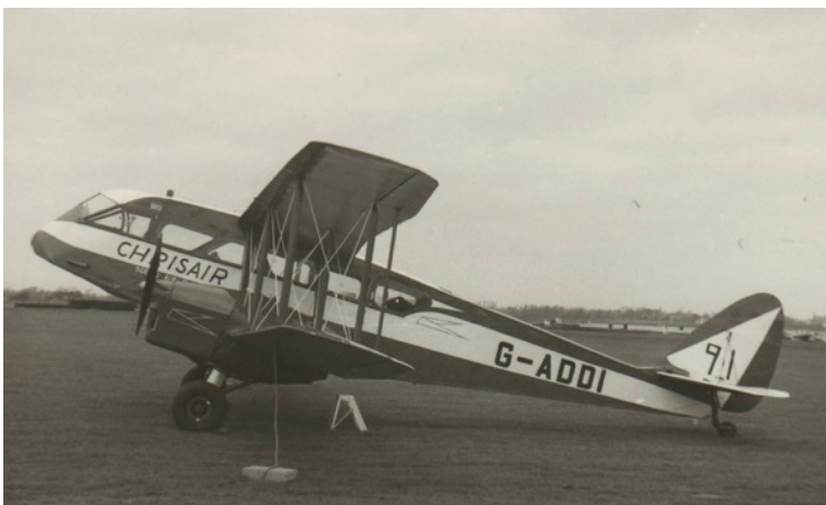
G-ADDI DH84 Dragon, Jersey - May 1965