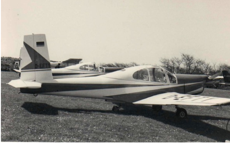
D-EFTY Orlican L40 Meta Sokol, Jersey - May 1965