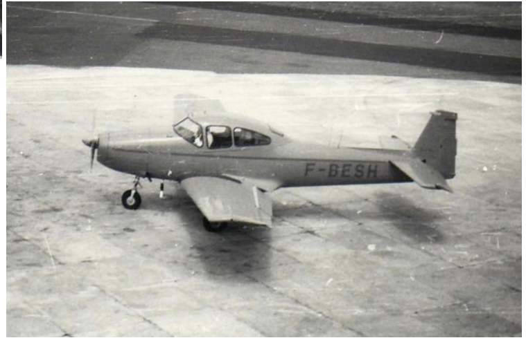
F-BESH Ryan Navion, Jersey - July 1963