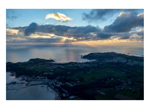
Johnny Kelly over St Aubins

The last two months of the year provided us a couple of crispy days for some sky time to remind us why we love it so much, sucking in the views on our scenic ride to altitude before the escape to freedom at the top.