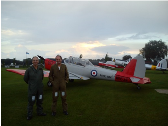
aircraft in high spirits ready to do the first sortie.