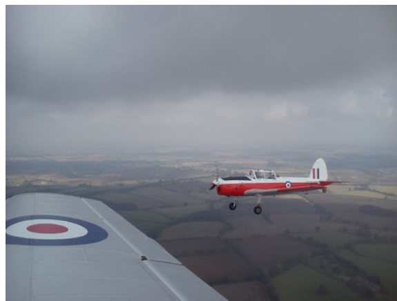
First formation sortie.

When we got back to Sywell more aircraft had turned up. The next sorties saw 3 formations head off to the designated training areas North and South of Sywell, and all ended with some great run & breaks to land giving the whole event a bit of an airshow feel to it. Indeed, there were quite a few spectators who turned up just to watch the sight of Chipmunks (& Bulldogs) coming and going.