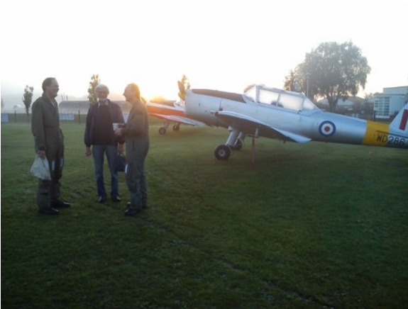
Getting ready for our Dawn Patrol and then the fog came